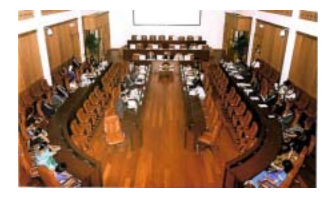
The June 3 Seminar in which Pyramid Scheme Alert participated was conducted at the Central Bank of Sri Lanka in Colombo, a beautiful and ultramodern facility with video terminals on each desk for viewing speakers.