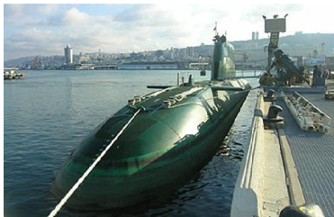
Dolphin fleet plays crucial role in game of deterrence

Israel's enemies must be made to understand that should they dare use any weapon of mass destruction, their own fate will be sealed. According to foreign reports, Israel's Dolphin fleet plays a crucial role in the game of deterrence with its second strike capability.