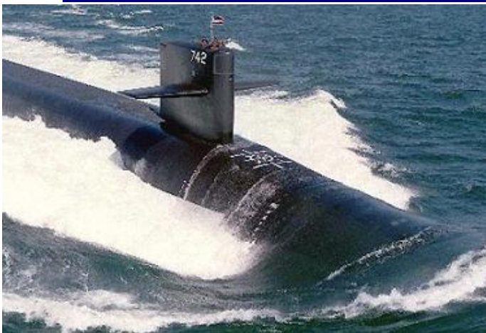
USS Wyoming, SSBN 742