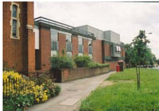
The original scheme by Sir Bannister Fletcher for the north front of the School, the 1899 Chapel as built, and the modern Senior School adjoining the Chapel

The Great Hall: The grade II Great Hall was designed by Sir Bannister Fletcher and built in 1899. As befits the author of the definitive A History of Architecture in the Comparative Method , the neo-Perpendicular design, with its high gable and projecting wings of red brick with ornamental stone parapets and window surrounds and tracery, makes a most distinguished contribution to the Conservation Area.