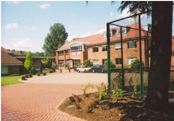
The entrance to the Priory building, The lodge at 72 Ridgway, and the memorial arch

Junior School and Music School: These parts of the School are accommodated in the modern wing lining the eastern side of the court. Each floor of the three storey red brick and tile building steps back, and the bands of windows separated by sloping roofs and terraces give a strongly horizontal emphasis which provides a suitable contrast in deference to the vertical accent of the Great Hall. At the southern end one-and-a-half storey Music School block in red brick is dominated by a shallow red tiled roof with hipped and gables roofs on the west side and continuous dormers along the south side. A flat roofed extension on the east side has a saw-tooth profile.