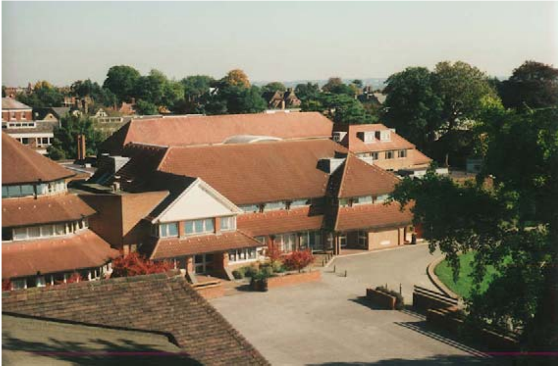
B: EASTERN SIDE OF THE CENTRAL COURT The Junior School from the Chapel roof

Junior School and Music School: These parts of the School are accommodated in the modern wing lining the eastern side of the court. Each floor of the three storey red brick and tile building steps back, and the bands of windows separated by sloping roofs and terraces give a strongly horizontal emphasis which provides a suitable contrast in deference to the vertical accent of the Great Hall. At the southern end one-and-a-half storey Music School block in red brick is dominated by a shallow red tiled roof with hipped and gables roofs on the west side and continuous dormers along the south side. A flat roofed extension on the east side has a saw-tooth profile.