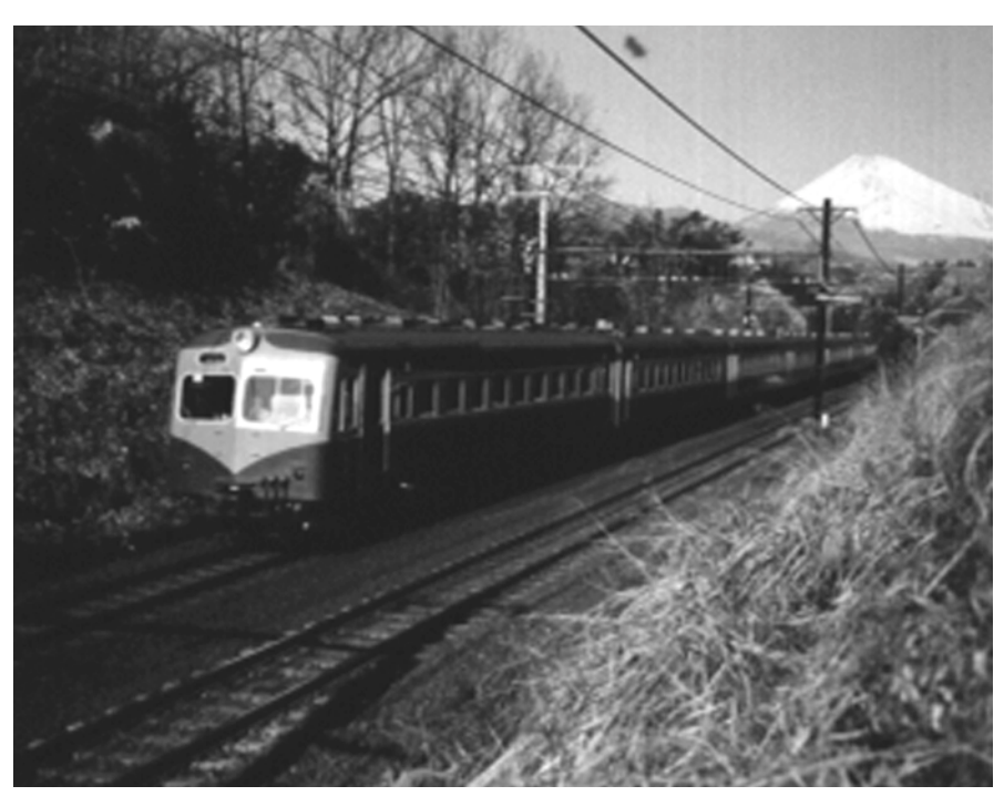
JNR's long-distance Series 80 Shonan Densha

The new Series 80 EMU was to be quite different in operation and technology from the existing electric trains and its development required different organizational arrangement from previous rolling stock. Responsibility for rolling-stock development within the Rolling Stock & Mechanical Engineering Department was divided between the Motive Power Unit Division and the Passenger and Freight Car Division. The former was responsible for developing locomotives and EMUs, while the latter was