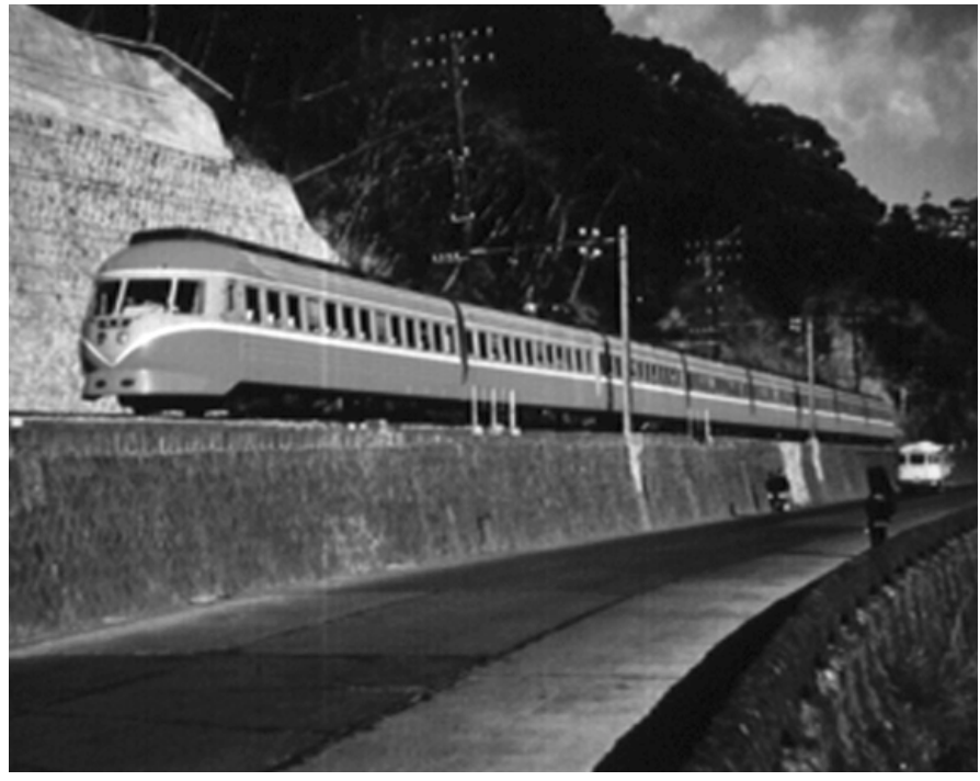
Odakyu's Series Deha 3000 SE Romance Car

railway time to improve the rolling stock, and breakdowns were soon occurring less frequently, proving that the new EMUs could offer services on schedule. The newly established JNR was soon confident enough to begin running local-express services on weekends between Tokyo and Numazu in October 1950. This was JNR's first EMU offering superior services.