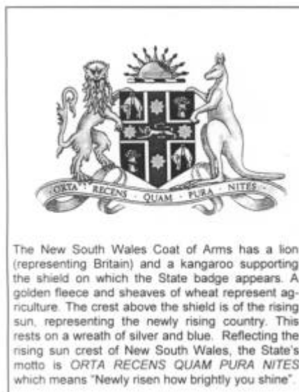
State Arms 43