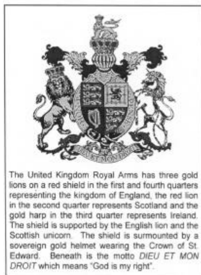
Royal Arms of the UK 38

supporters are the English lion and the Scottish unicorn and the shield is surmounted by St Edward's Crown. Around the base of the shield are the shamrock, thistle and rose, the floral emblems of Ireland, Scotland and England, respectively.