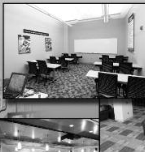
The Burton Family Football Complex features a large team meeting area, rooms for each position group and a spacious player lounge.