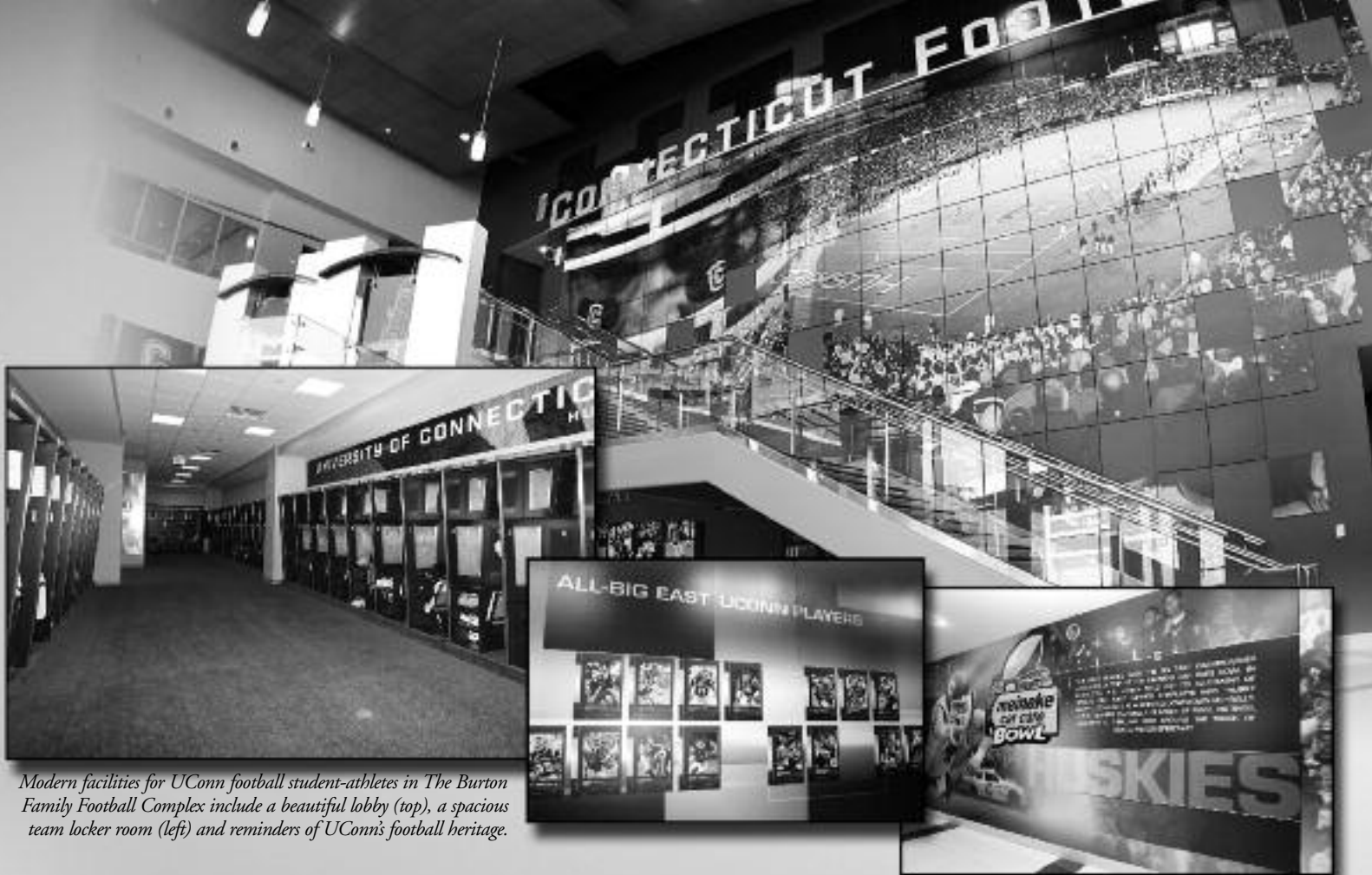
Modern facilities for UConn football student-athletes in The Burton Family Football Complex include a beautiful lobby (top), a spacious team locker room (left) and reminders of UConn's football heritage.