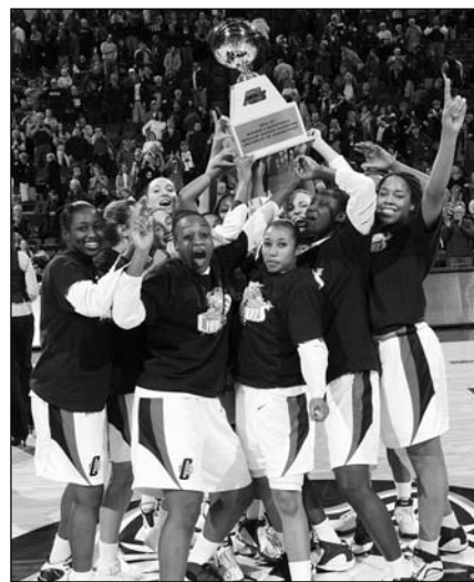
The Huskies celebrate after being awarded the 2006-07 BIG EAST Regular Season Championship Trophy.