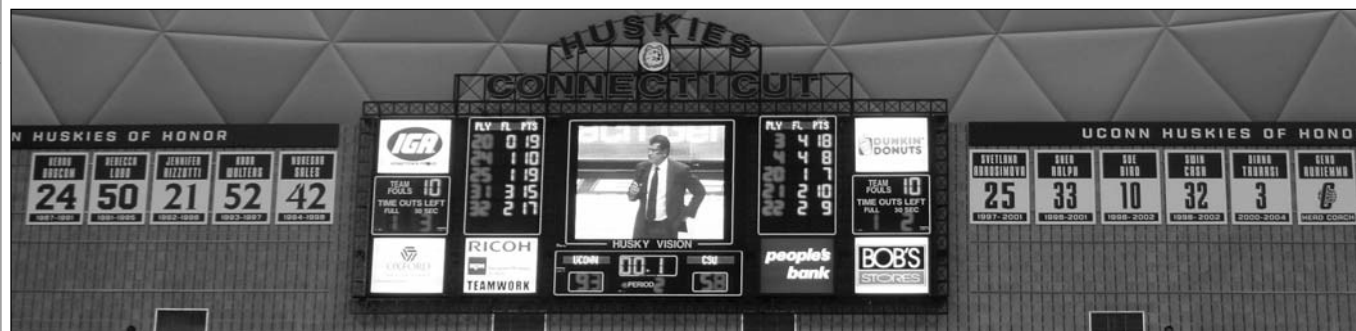
In 2006, the Huskies honored 10 former players and head coach Geno Auriemma as the inaugural inductees into the UConn Huskies of Honor.