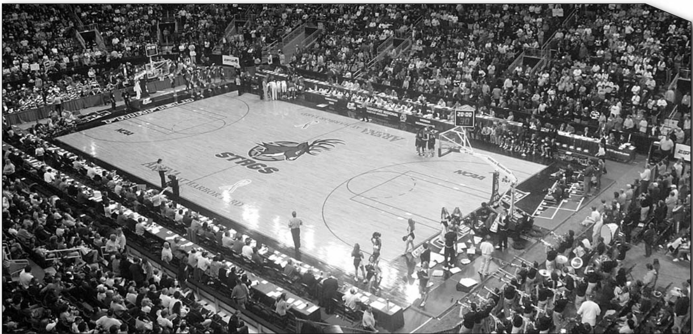
THE ARENA AT HARBOR YARD IN BRIDGEPORT WILL HOST THE OPENING TWO ROUNDS OF THE 2008 NCAA WOMEN'S BASKETBALL TOURNAMENT. UCONN FACED GEORGIA AND DUKE IN ITS MOST RECENT APPEARANCE AT THE FACILITY DURING THE 2006 BRIDGEPORT REGIONAL.

UConn's NCAA Neutral Site Record: 33-10 (.767)