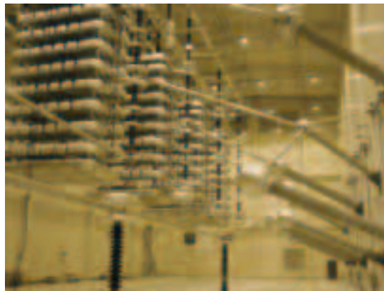
Fig. 3. Double Valve Arrangement

Physically each converter is built up of twelve (air insulated, water-cooled) single valves arranged in six units. Each suspended unit consists of two single valves combined into one mechanical unit called a double valve (Figure 3). The valve structure is suspended from the ceiling, which gives a superior mechanical design for all static and dynamic conditions. The light guides for control and monitoring, as well as the cooling water connection pipes, enter from the ceiling of the valve hall. There are 90/84 thyristors per valve at Longquan/Zhengping respectively. The thyristors used are 5" (YST90) and are identical for the two stations.