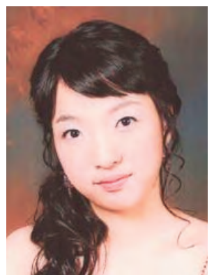
Schools and Teachers Seoul National University