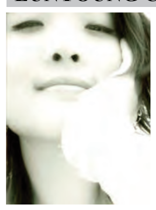
KOREA Age 28