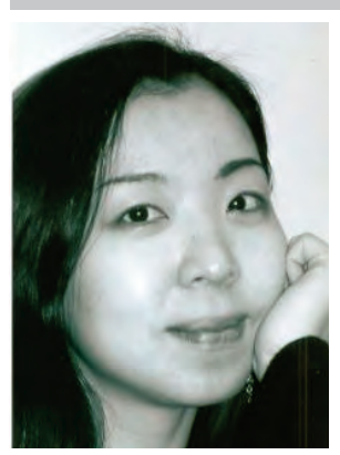
USA Age 28