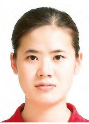
TAIWAN Age 28