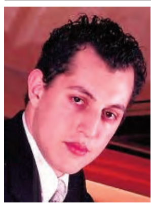
ARMENIAN Age 25