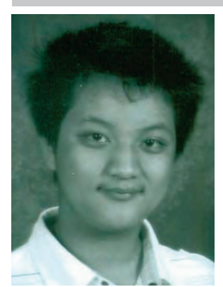
CHINA Age 19