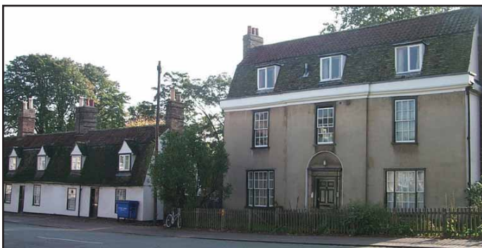
Nos 2-8 Chesterton Road