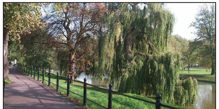
View to Jubilee Gardens