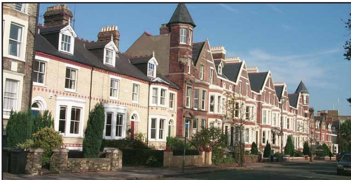
Chesterton Road - north side

Commercial premises tend to be clustered towards the eastern end of the road where the public conveniences and recycling centre are also located. In addition, the road also contains a variety of businesses and residential accommodation.