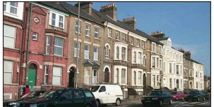
Chesterton Road - north side