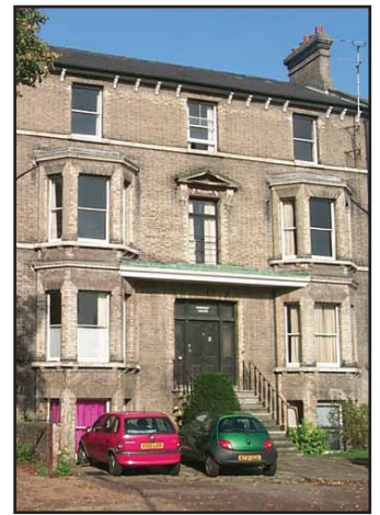
No 3 Chesterton Road