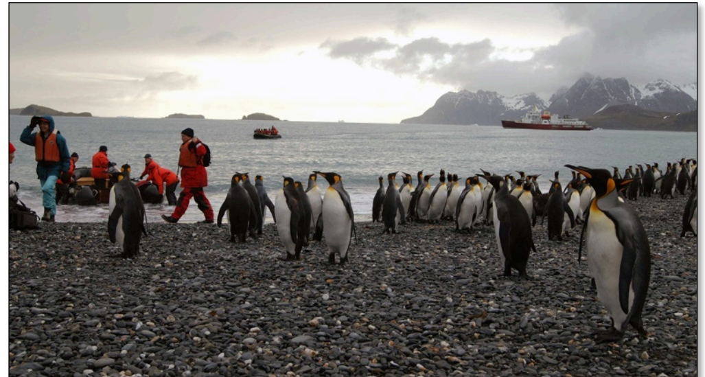
Salisbury Plain landing beach