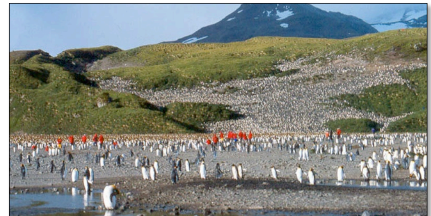
Closed Area A includes a 10m buffer zone