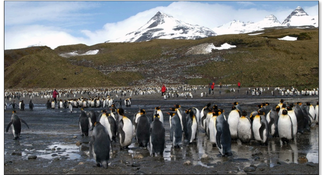
King Penguin Colony