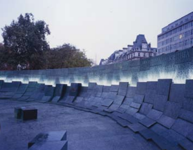
Australian War Memorial, London at night