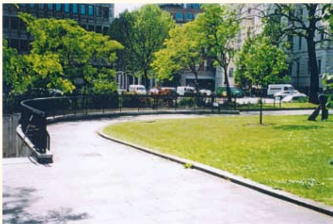
Memorial site, Hyde Park Corner prior to construction

The site of the Australian War Memorial is within the 1.5 hectare parkland known as Hyde Park Corner, in the heart of London. The site was identified as a potential memorial location in the master plan report on initiatives to improve and upgrade the area. It was commissioned by English Heritage on behalf of the Hyde Park Corner Steering Group, comprising representatives from major London authorities including Westminster City Council.