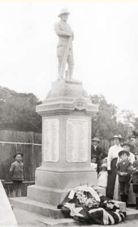
Memorial unveiled in December 1917 to honour the men and women of Ipswich, Queensland, who enlisted in World War I. [AWM H17698]

Department of Veterans' Affairs Internet site and the public was invited to review the selection before the names were finalised.