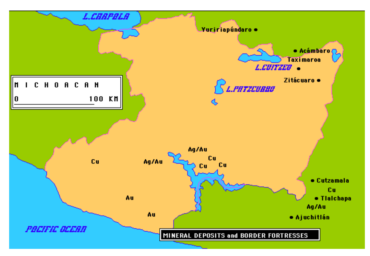
Figure 4. Mineral Deposits and Border Fortresses of the Purépecha Region.

The argument for the Andean origin rests on evidence in addition to that of language affinity, settlement pattern, and knowledge of metallurgy. Other South American elements were in the Purépecha cultural baggage. Their stirrup-handle teapots have a "distinct flavor of Peru or Ecuador" (Craine and Reindorp 1970, xiii). A low structure with a trapezoidal doorway in Arcelia, Guerrero, duplicates features found among the Incas, but the site might be outside the Purépecha settlement area (Adams 1991, 324). The site is 20 kilometers southeast of Tlalchapa, near the border of the Aztec sphere of interest, and is well within the fortified perimeter of Purépecha settlement. Three of the seven main Purépecha border fortresses guarded the approaches to the Rio Balsas depression (Fig. 4). Even though the depression was not the religious and political core of the Purépecha, the mineral endowment gave it strategic importance that warranted protection from Aztec incursion.