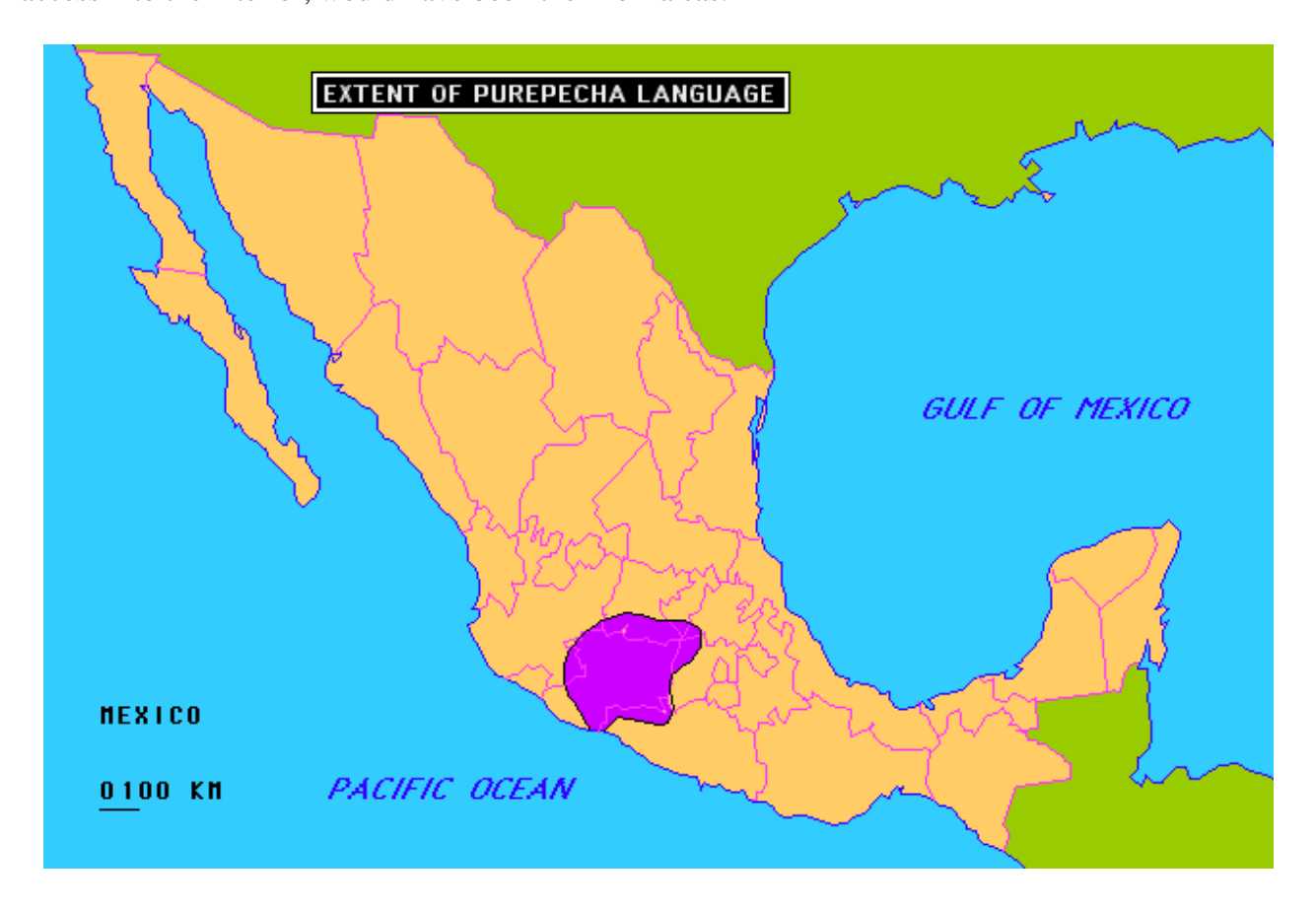
Figure 3. Areal Extent of Purépecha Language circa AD 1500.

interior. On the other hand, if they lacked a suitable craft for open-ocean sailing or if their provisions were inadequate for the journey, they may have chosen to skirt the coast, which would have added more distance to their voyage but would have reduced the risks. Even so, the first river of any size along the Mesoamerican coast, and thus the first gateway that promised them access into the interior, would have been the Rio Balsas.