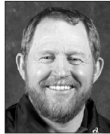
Pee Wee Halsell Indoor & Outdoor Track & Field/ Cross Country