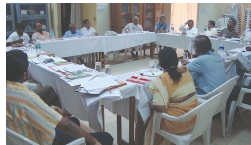
Executive Committee of the Urban Rural Mission (URM) on Feb.2, 09 at Nagpur