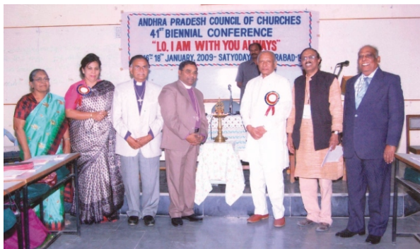
41st Biennial Conference of the Andhra Pradesh Council of Churches, 16-18 January 2009, Hyderabad

The Andhra Pradesh Council of Churches held its 41st Biennial Conference from 16th to 18th January, 2009 at Satyodayam, Hyderabad. The theme of the conference was "Lo, I am with you always". 140 delegates representing the member churches and the organizations attended the conference. The conference was inaugurated by Dr.A.Chakrapani, the Hon'ble Chairman of the Andhra Pradesh State Legislative Council. Dr.Chakrapani, congratulated the APCC for its role in coordinating and consensus building to be