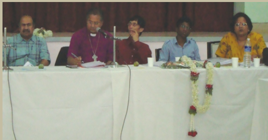
The NCCI Presidium at the Executive Committee Meeting held from Feb.26-29, 2009 at ECC, Whitefield.