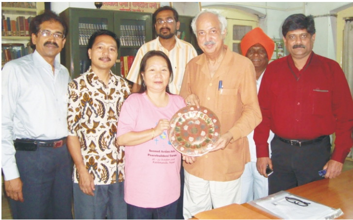
Senator (R) Iqbal Haider, formerly Federal Minister, Pakistan in a goodwill visit to NCCI on 04/03/2009