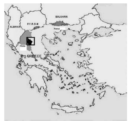
Figure 1. Brown bear range in Greece and study area

Our study site Grevena extends over 800 km<sup>2</sup> of a mixed forest and agricultural ecosystem and is located in the north-eastern part of Pindos mountain range (Lygos and Hassia mountain massifs) (Fig. 1). Of this area 75% are forests, 10% meadows (pasture lands), 14% agricultural lands, whereas low population density human settlements occupy 0.3% of the total area. Major forest vegetation types comprise oak (Quercus spp.), black pine (Pinus nigra ssp. nigra var. caramanica) and beech (Fagus sylvatica ssp. sylvatica). A mosaic of dense forests, openings and small-scale cultivations characterizes the area. Altitude ranges between 500 m - 2200 m asl. Mean monthly temperatures range from -3.4° C min to 28.2° C max. Mean annual precipitation is 589 mm. [13]. Part of the study site is included in the Northern Pindos National Park.