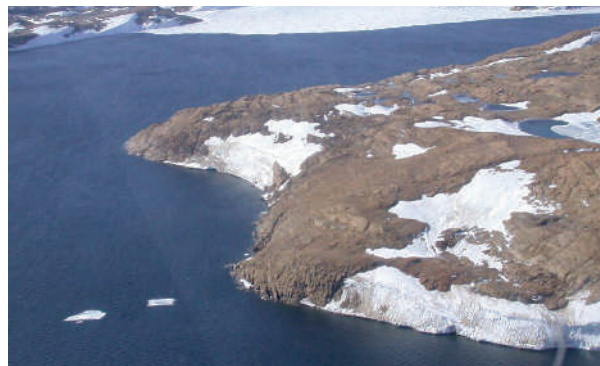
Home from home: India wants a research base in the Larsemann Hills.