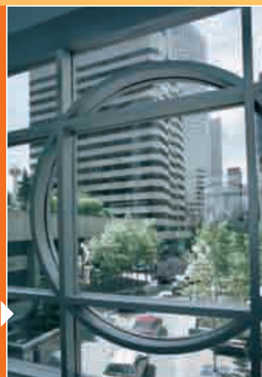
The view looking south from one of the +15 bridges over Barclay Mall.