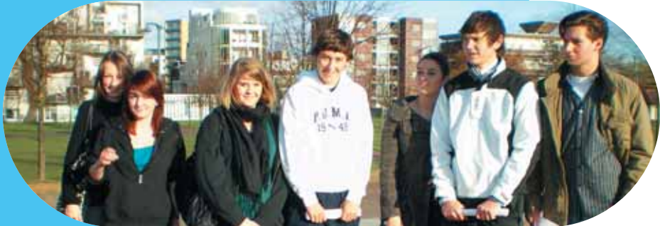
Higher Geography students at Glasgow Green in front of the 'Homes for the Future' development

They started at the original site of the city and observed the growth and development of the city through the centuries, paying particular attention to recent changes along the River Clyde.