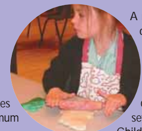
Baking cakes for mum

A range of activities is offered including arts and crafts, board games, computer games, snooker, table tennis, outdoor play, drama, baking, knitting, sewing and library visits. Children can also complete homework and healthy snacks are available.