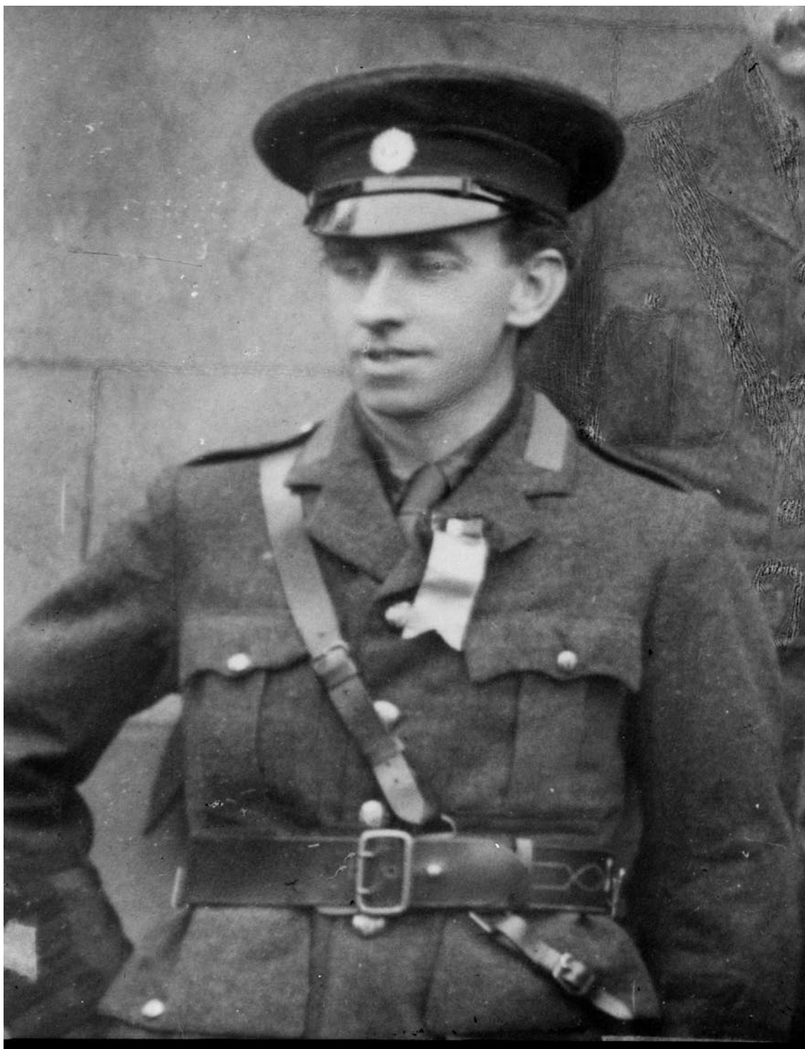
Thomas MacDonagh in his Volunteer uniform.