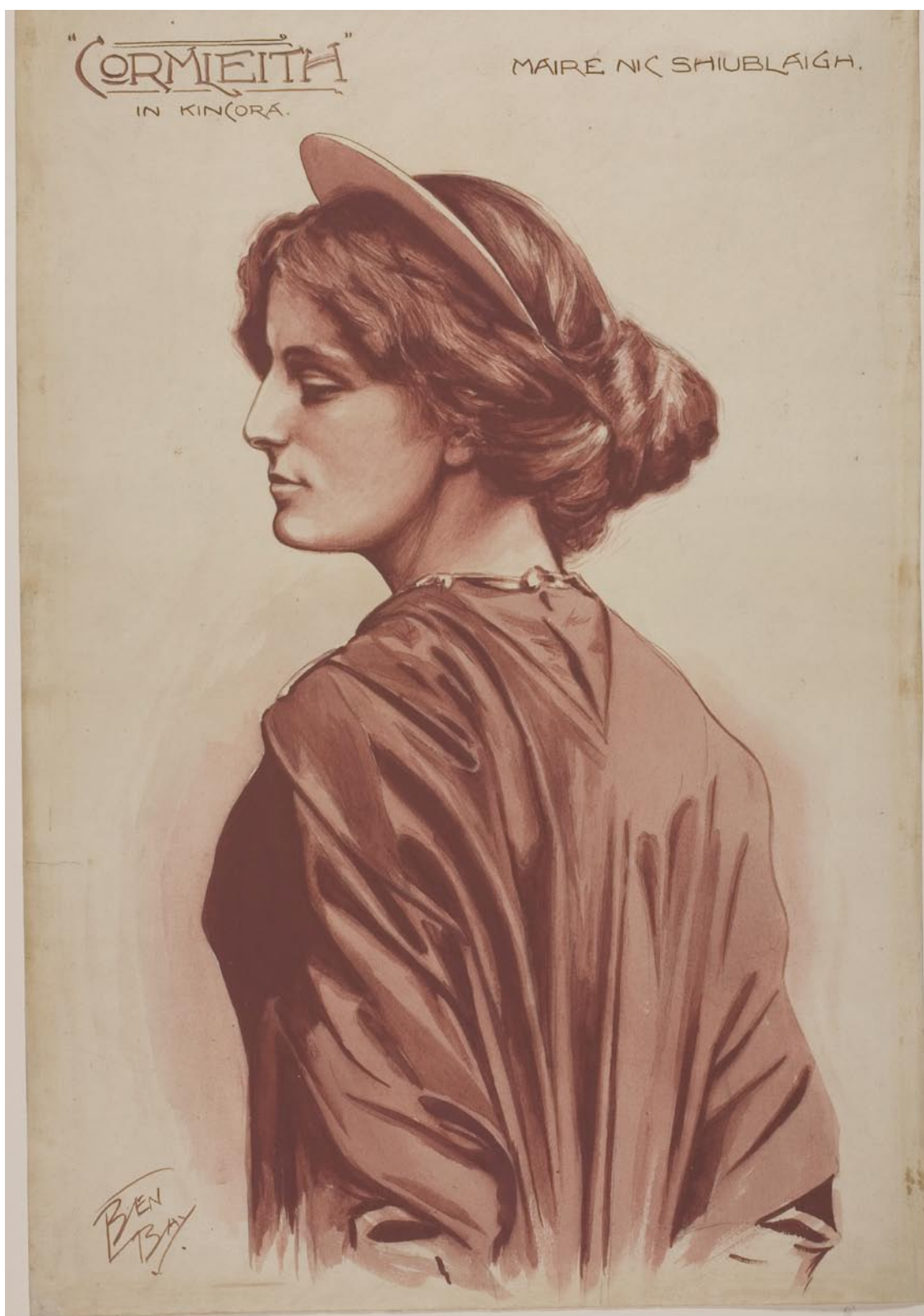
The actress Máire Ní Shiubhlaigh, one of the Cumann na mBan women in Jacob's.