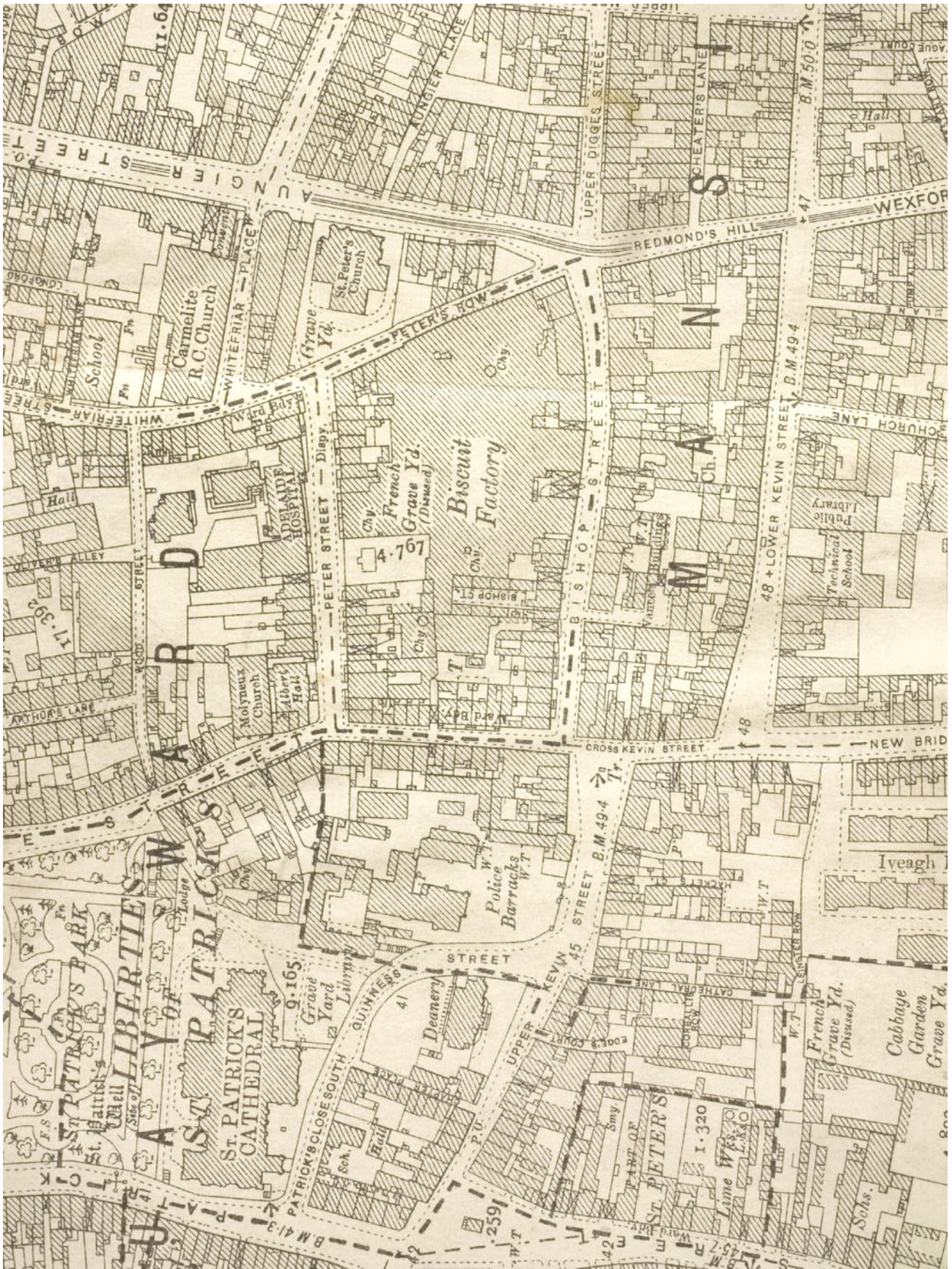
Map showing the Jacob's area. (Ordnance Survey, 1:2,500 (25 inches to mile), Dublin, sheet XVIII, 1911; scale altered).