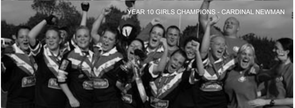
YEAR 10 GIRLS CHAMPIONS - CARDINAL NEWMAN