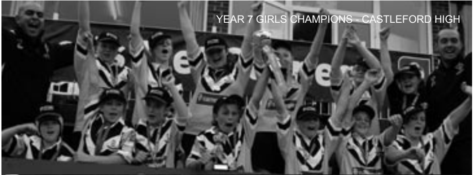
YEAR 7 GIRLS CHAMPIONS - CASTLEFORD HIGH