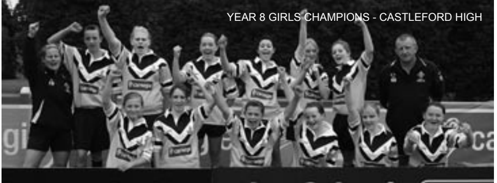
YEAR 8 GIRLS CHAMPIONS - CASTLEFORD HIGH