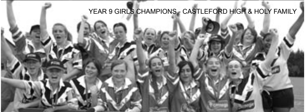
YEAR 9 GIRLS CHAMPIONS - CASTLEFORD HIGH & HOLY FAMILY