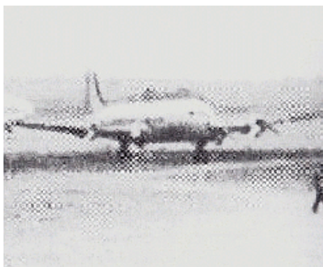
A rare photo of one of the C-54s of the Fuerza Aérea de Liberación at Retalhuleu in 1960/1

a month, 110 but in January 1961, there were as many as 5 C-54 flights arriving each month with new troops for Trax Base. 111