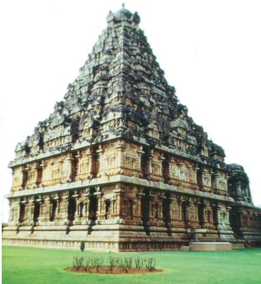
Fig. 3 The temple at Gangaikondacholapuram. Notice the way in which the roof tapers. Also look at the elaborate stone sculptures used to decorate the outer walls.

Chola temples often became the nuclei of settlements which grew around them. These were centres of craft production. Temples were also endowed with land by rulers as well as by others. The produce of this land