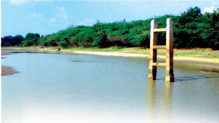
Fig. 5 A ninth century sluice- gate in Tamil Nadu. It regulated the outflow of water from a tank into the channels that irrigated the fields.

flooding and canals had to be constructed to carry water to the fields. In many areas two crops were grown in a year.