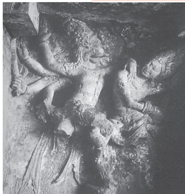
Fig. 1 Wall relief from Cave 15, Ellora, showing Vishnu as Narasimha, the man-lion. It is a work of the Rashtrakuta period.

Many of these new kings adopted high-sounding titles such as maharaja-adhiraja (great king, overlord of kings), tribhuvana-chakravartin (lord of the three worlds) and so on. However, in spite of such claims,