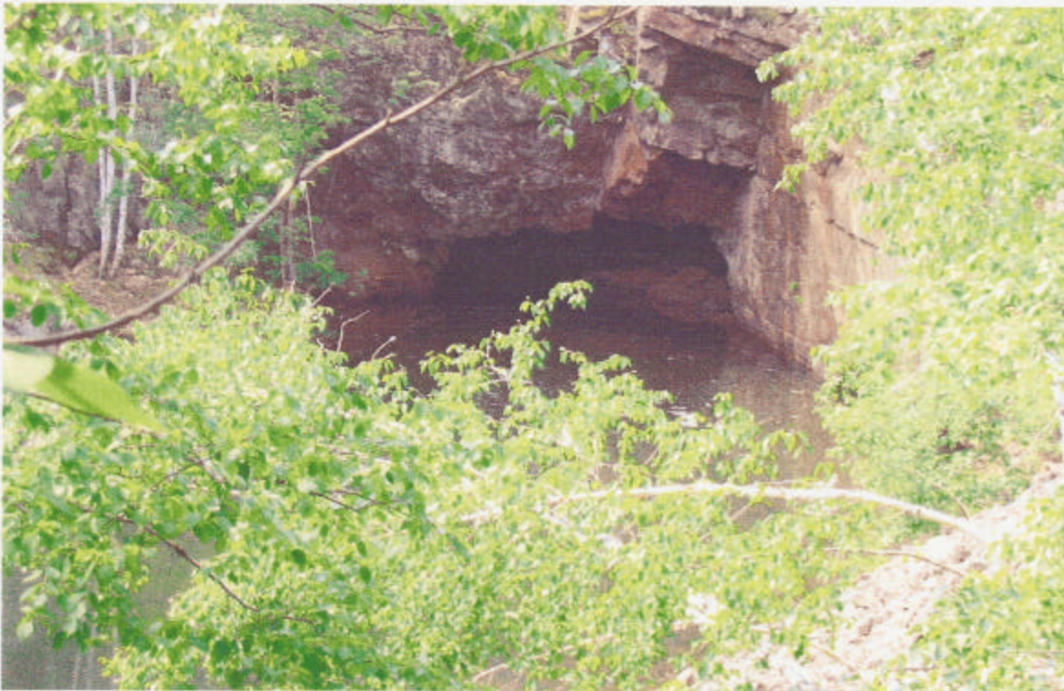
North Jackson Pit #3 & Tunnel