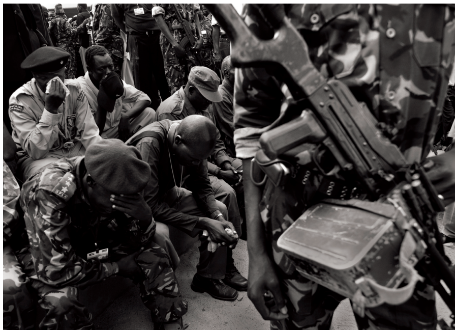
SPLA soldiers mourn during the funeral of former Sudanese vice-president and SPLA rebel leader John Garang in Juba, August 2005.

The CPA stipulates that no armed groups allied to either the SPLA or the SAF shall be allowed to operate.