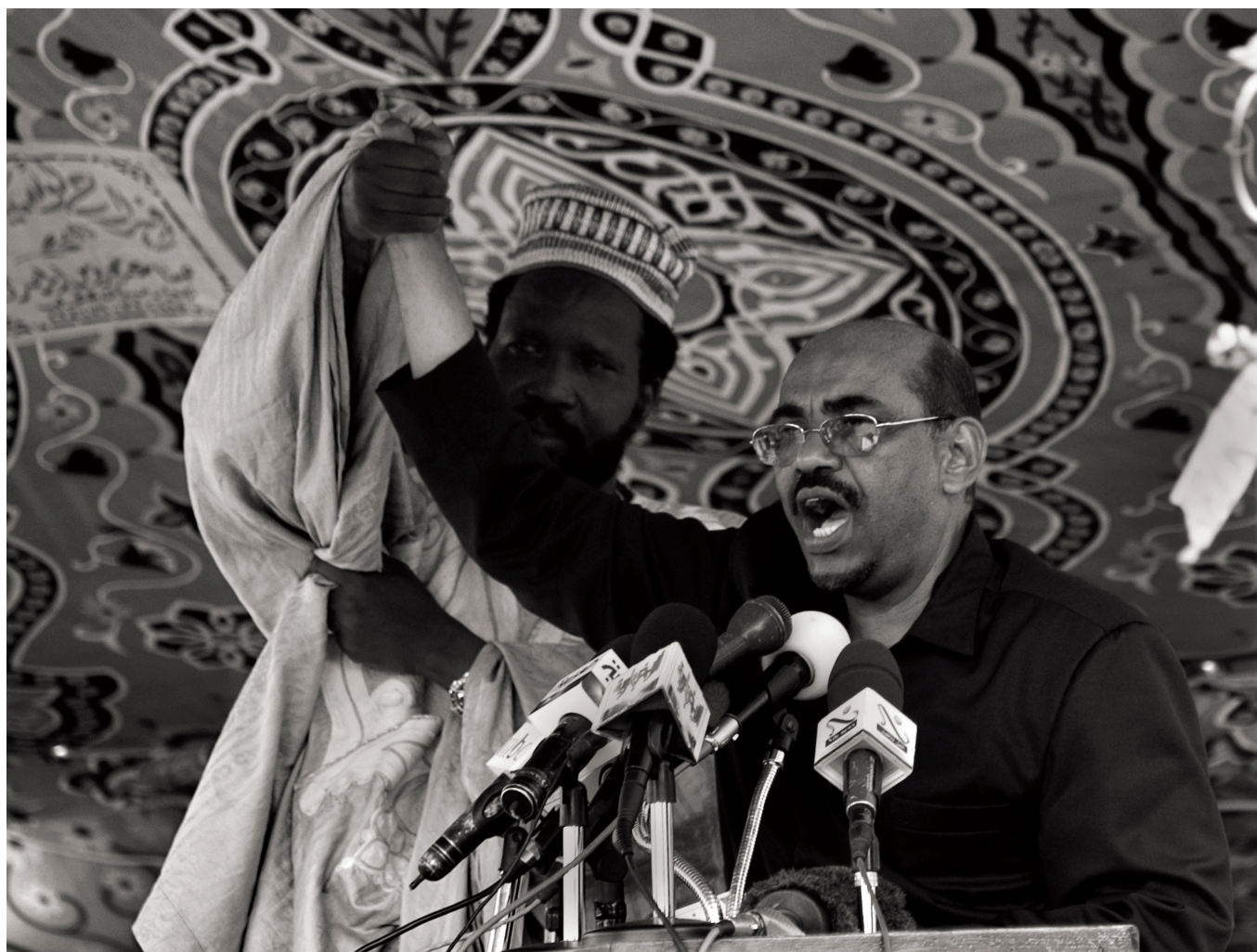
Sudanese President Omar al-Bashir (right) raises hands with Salva Kiir, John Garang's successor, in August 2005.

Integrating SSDF forces still waiting for ranks. A particularly difficult problem is the assignment of appropriate ranks for incoming SSDF officers, without which they remain sidelined and unintegrated. The present composition of the SPLA high command remains the same today as it was before the signing of the Juba Declaration. This issue is of critical importance to incoming forces: the longer it is delayed, the longer incoming SSDF will be marginalized, increasing the likelihood of discontent and violence. 25 Lessons from previous DDR operations in Africa suggest that the integration of former enemies into an existing command structure will be extremely difficult for many SPLA members to accept.