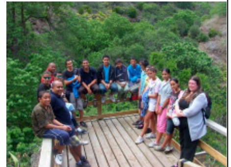
At Heart shaped waterfall