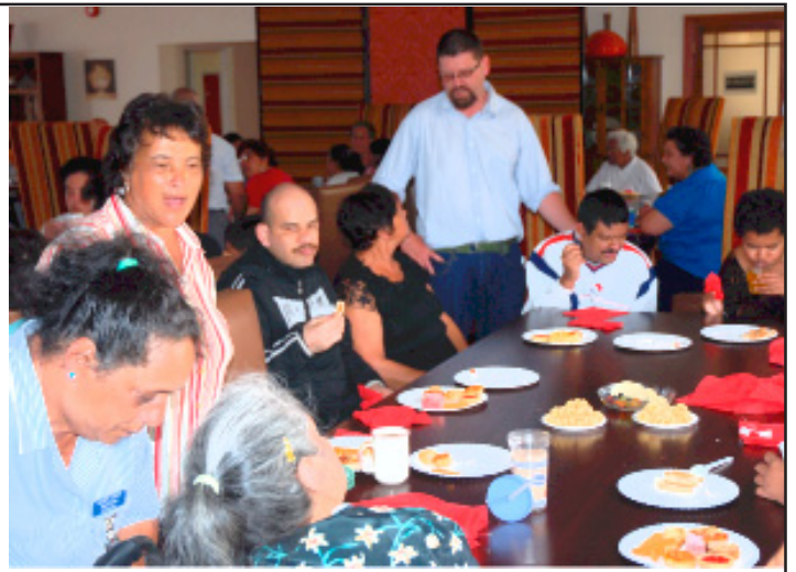
A much appreciated party for the Island's disabled was held at the Community Care Complex on Saturday afternoon.