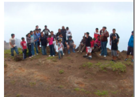
At Thompson's Wood