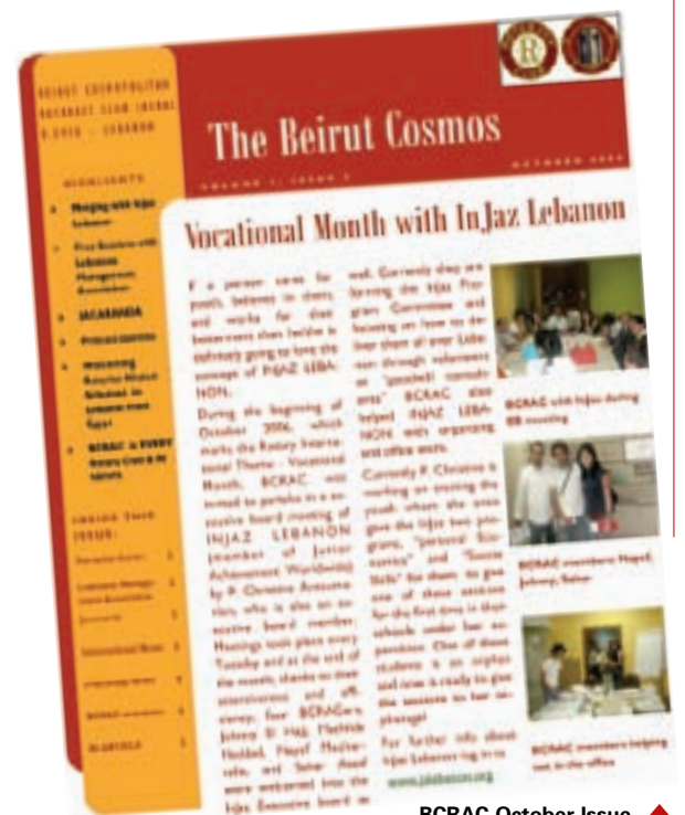
BCRAC October Issue ▲