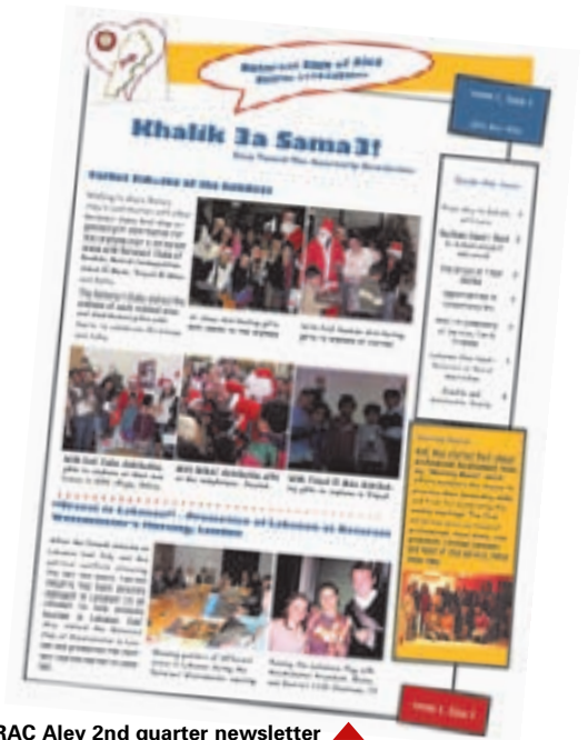
RAC Aley 2nd quarter newsletter ▲