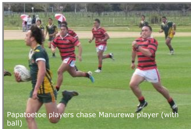
Papatoetoe players chase Manurewa player (with ball)