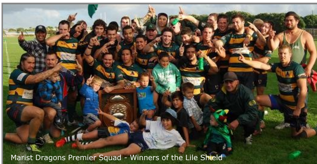
Marist Dragons Premier Squad - Winners of the Lile Shield

To end our hugely successful season we had some fun with friends & enjoyed our annual club day, where past players showed present players how you play a good game of league & win, followed that night with a themed prize giving. We are very proud of all the players who have taken the field for our club throughout all the years I would like to thank everybody who has put their blood, sweat & tears into building our club & making it a place where everyone wants to be.