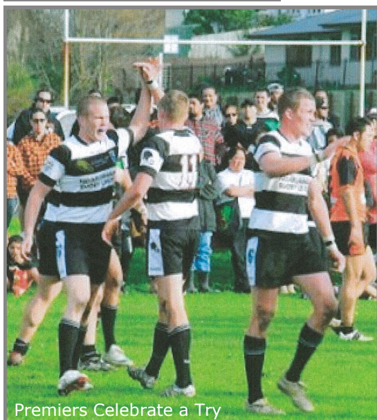
Premiers Celebrate a Try