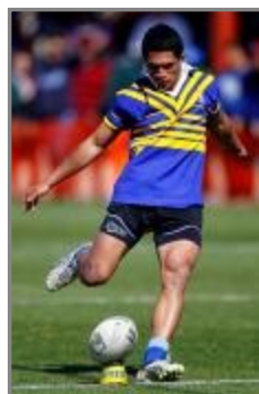
National Secondary Schools page 4

With the international season starting in just three weeks in Rarotonga. We'd like to wish all the players a healthy finish to their club season and every success in the upcoming test matches. Go the Kiwis!