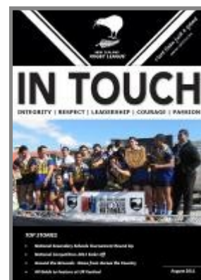
Cover: Otahuhu College celebrate their golden point win.