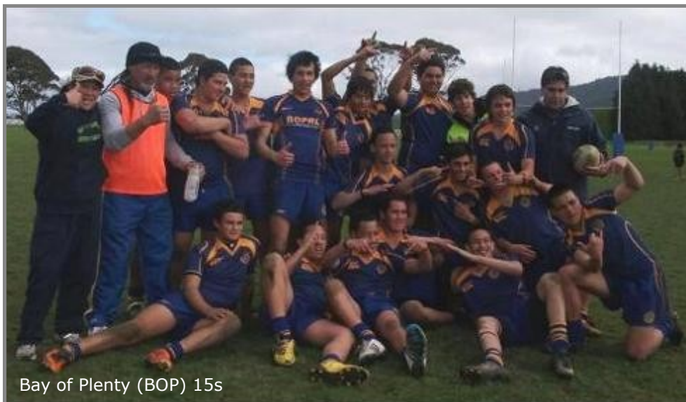
Bay of Plenty (BOP) 15s