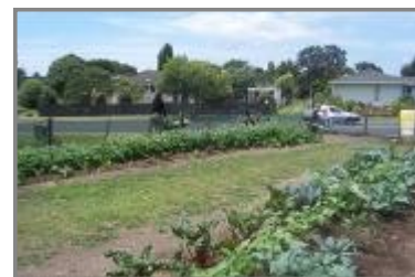
Club Backs Up Healthy Messages page 23