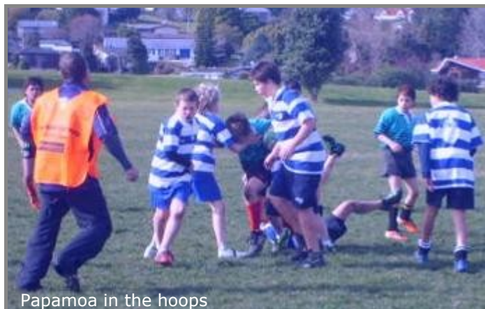
Papamoa in the hoops

The feed back from schools has been very positive and the tournament is a great advertisement for our game.