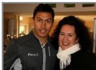
Players Return to Support Zone page 15