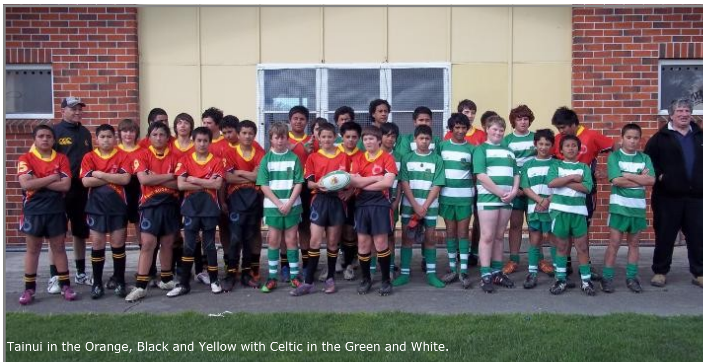
Tainui in the Orange, Black and Yellow with Celtic in the Green and White.

It is pleasing to go to a match and watch a game where the supporters are so well behaved. This display bodes well for Junior Rugby League in Manawatu and shows that Rugby League is working hard on improving sideline behaviour across the country.