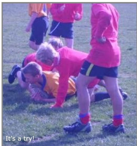
It's a try!