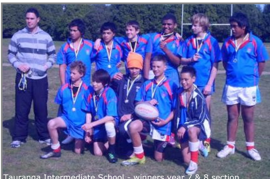
Tauranga Intermediate School - winners year 7 & 8 section