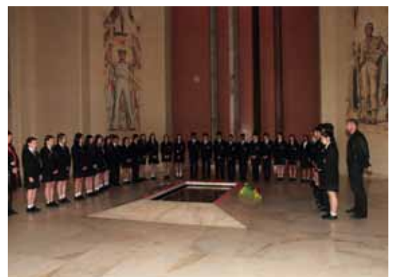
Students around the tomb of the unknown soldier in Canberra