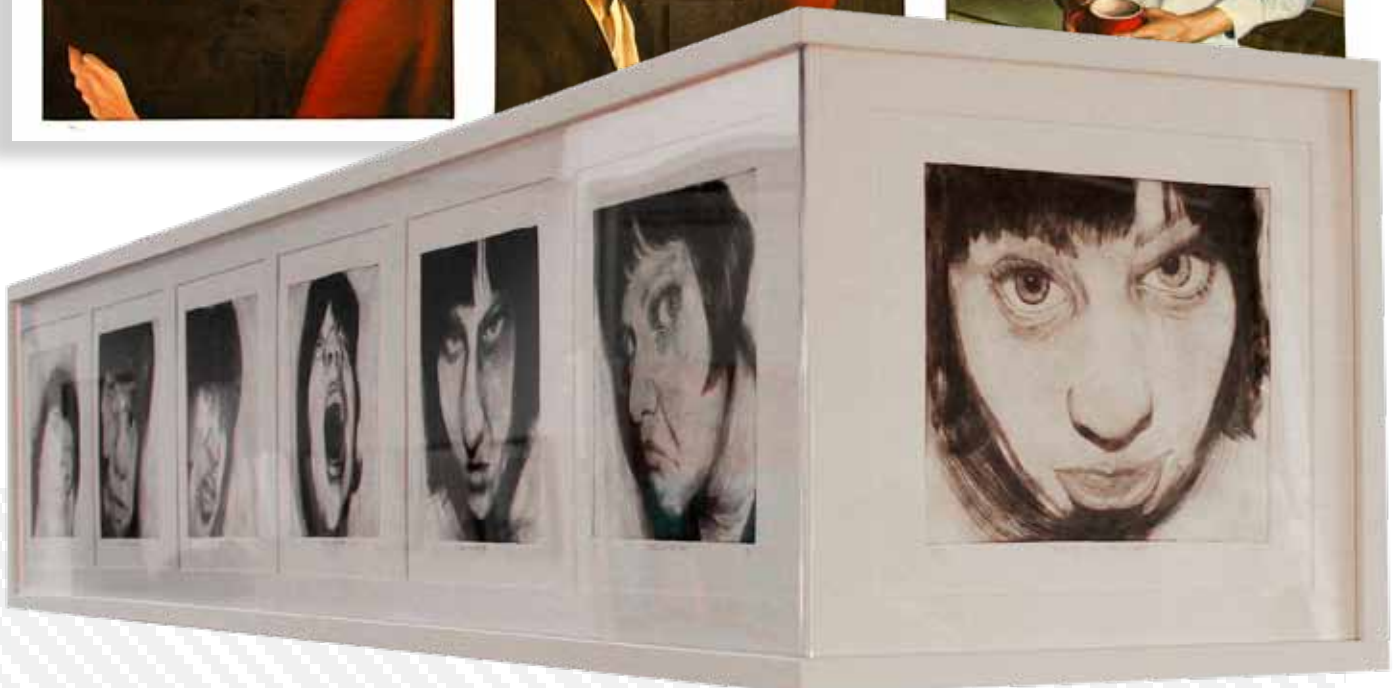
The art works will be displayed in the Western Australian Art Gallery from 11 February 2012.