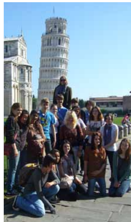
Italian tour students by the Leaning Tower of Pisa