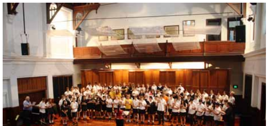
Music Chorale rehearsal

2011. It has been an amazing year for the students and staff of the Music Department with an event taking place almost each week throughout the year. I would like to sincerely thank all Music staff, students and parents for their outstanding contribution to the school during 2011.