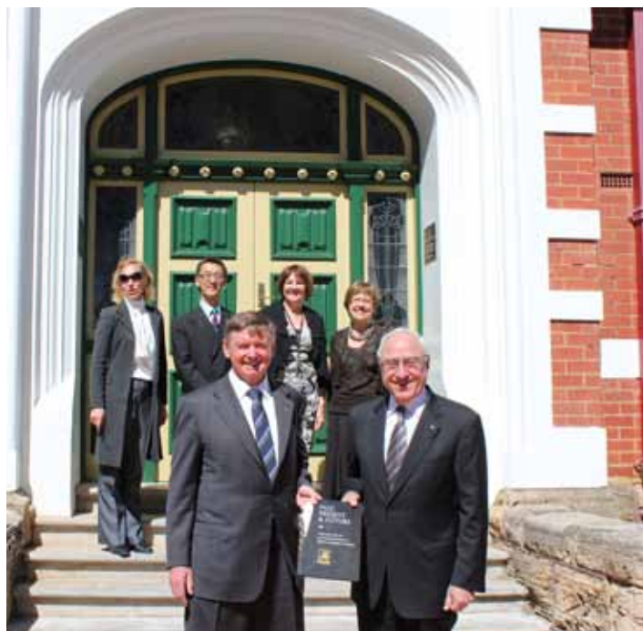
Book Launch - Past, Present & Future