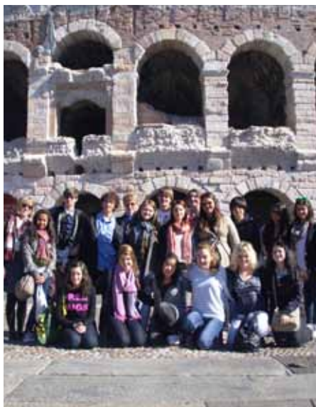
Italian tour students in front of the Colosseum

"A most cherished part of the tour was sauntering through the markets of Firenze and beholding a veritable cornucopia of assorted treasures, trinkets, baubles and belts."