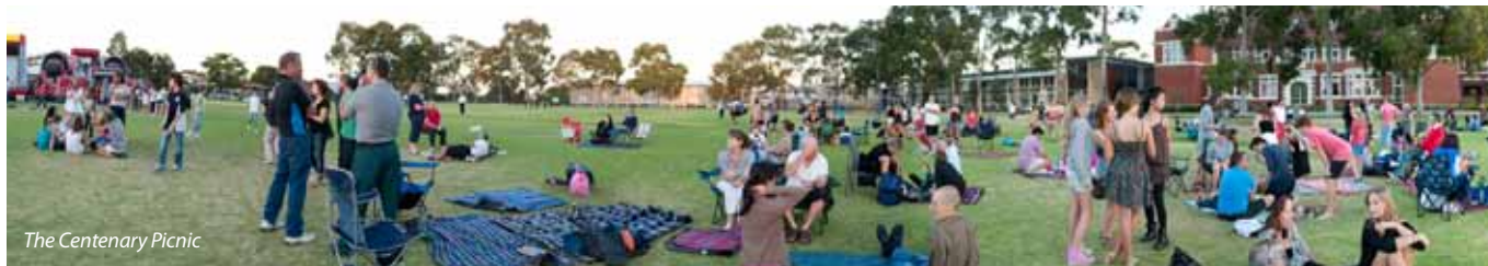
The Centenary Picnic