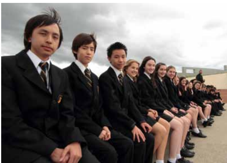
Canberra tour group at Parliament House

Activities were planned for each evening and on the first evening we visited the Mount Stromlo Observatory. At the observatory we were enthralled by a 3D movie and were given glimpses of Jupiter and the moon. The next evening we had a breathtaking view of Canberra