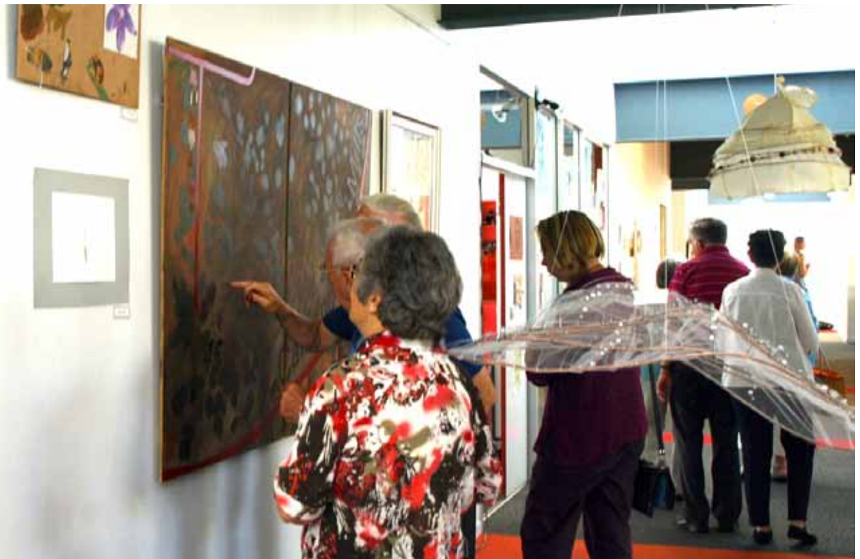
Guests viewing current students' work