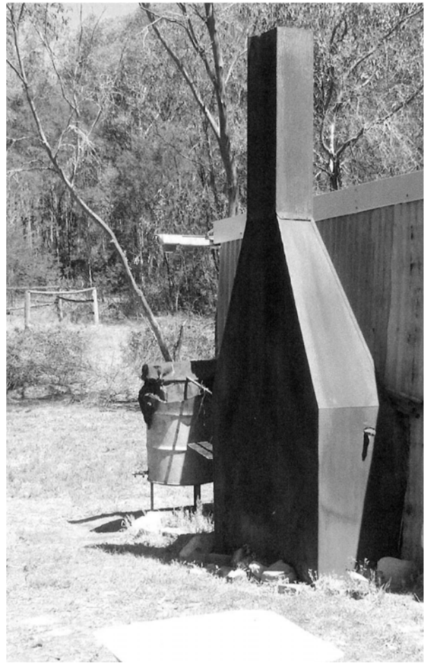
Laverty's hut chimney, before works.

Work left on the fireplace is to make up flashing for the top of the stone work. The fire place is now safe from starting a fire on the outside of the hut should grass grow too close to the hut. Sincere thanks to P.G.Cooksey for donating the cement and sand and being a big help on site. He is also making the flashing to finish the job. All up 9 bags of cement and over 1.2 cubic metres of sand were used plus conmix and cement on the footings.