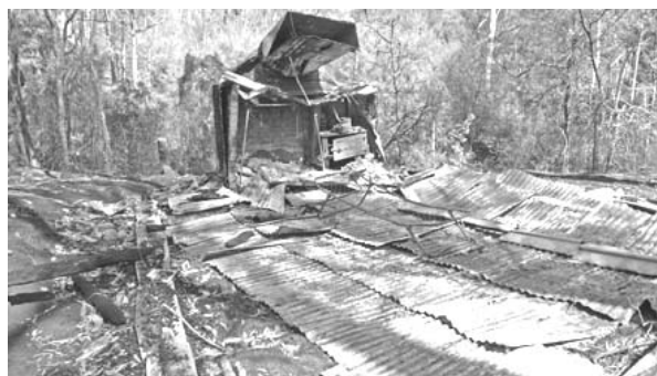
Ritchie's hut, 21 February 2007.