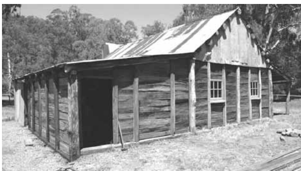
Fry's Hut east wall