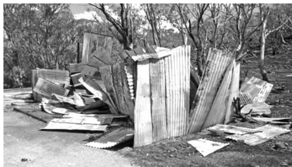
Bluff hut, 21 February 2007.