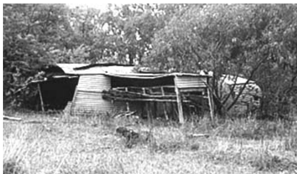
This above photo shows the Flying Swagman hut circa 1984. Sadly, below is what it looks like now.

With DSE being somewhat busy with fires and fuel reduction burning no work was done over summer. Richard is working on the heritage listing application for the Flying Swagman Hut. This is a unique structure built to cover a glider, which its owner literally catapulted into the air from the top of the hill where the hut is located. More on this intriguing piece of our high country heritage in future issues of Echo from the Mountains .