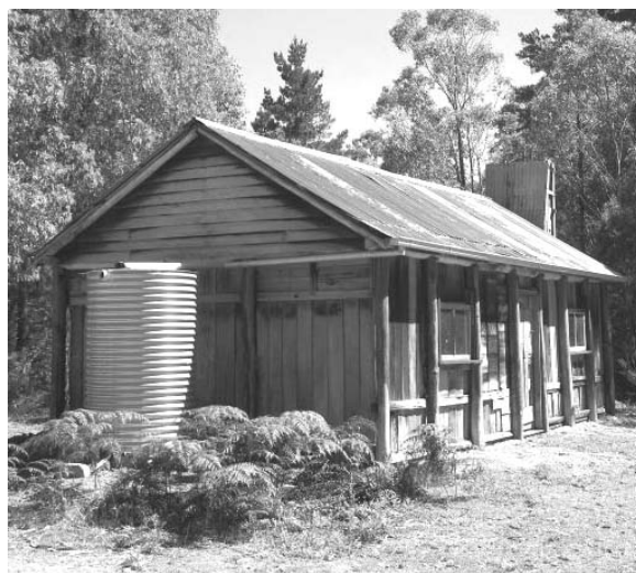
Wilson's hut: new water tank and gutters

Andrew has been instrumental in organizing recent maintenance works at the site, including the procurement of materials and labour to undertake full replacement of all external timber posts; reinstatement of the hardwood floor including repairs to several bearers and joists; replacement of several window frames and glass panels; re-construction of the timber and corrugated iron chimney and re-bricking of the fireplace; installation of a galvanized iron water tank and connections to the gutters; replacement of old gutters with new galvanized iron gutters; and whitewashing of the inside walls.