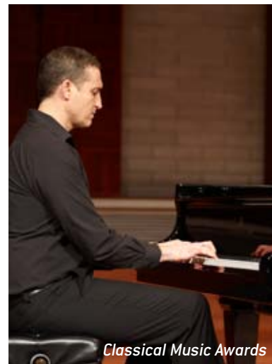
Classical Music Awards