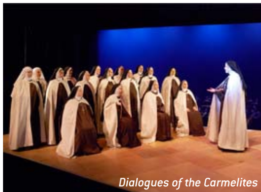
Dialogues of the Carmelites