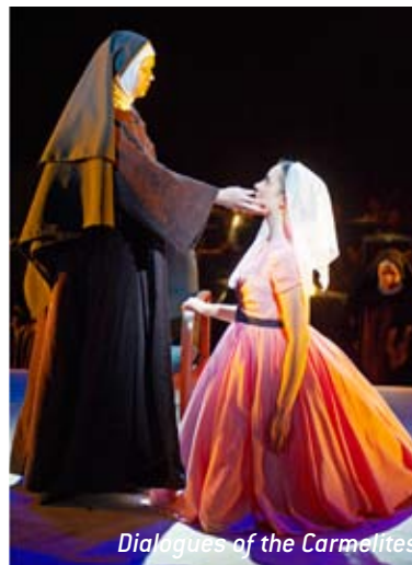
Dialogues of the Carmelites