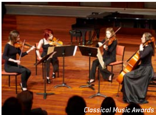
Classical Music Awards