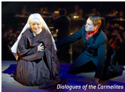
Dialogues of the Carmelites