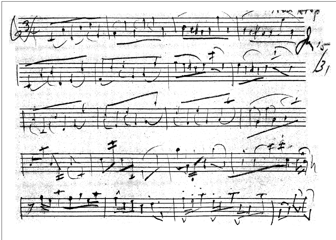
MS 103 Exercise on line 5 is not in the Daily Drills .

are often several exercises on each page of manuscript. The music notation is quite consistent in style and, upon examination, the majority are consistently similar or exactly the same as the corresponding exercises in the Daily Drills . There are a number of notable differences however, which we feel are significant. A word about the collection of music is in order. The publisher's photo proofs consist of 61 pages on black photograph paper (10½ × 13½) with white notation which is identical to the published book. There are three additional pages of introduction also identical to the material in the published book. According to Ms. Freistadt, the handwritten music notation of these proofs are not in her father's hand but quite probably that of a professional music copyist or possibly in the hand of Kalman "Charles" Schlossberg, Max Schlossberg's son. Kalman Schlossberg later published an edition of the Daily Drills for trombone. Also in the family's possession is Max Schlossberg's Bach Stradivarius B-flat trumpet, dated 1929.