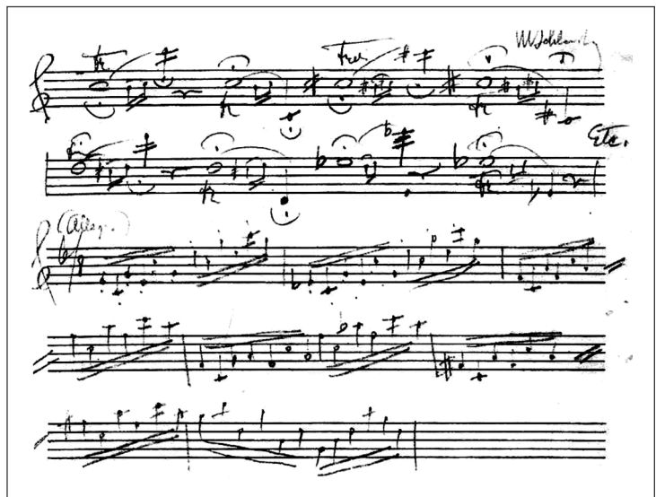
MS un-numbered. The trills exercise in lines 1 – 2 is not in the Daily Drills .

Daily Drills , and completely new material invented. Miller also noted differences between Schlossberg's teaching style and