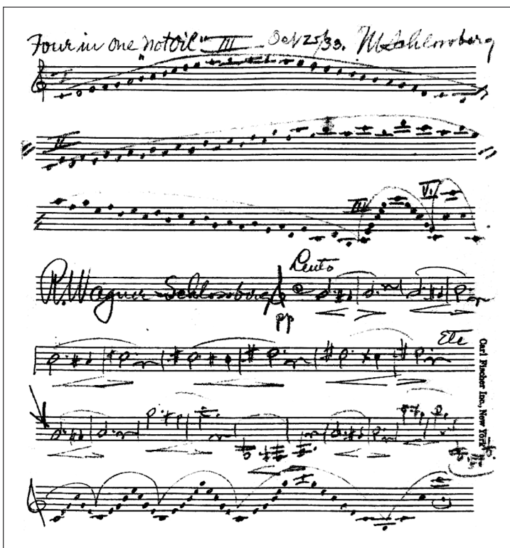
MS unnumbered October 25, 1933, "Four in One Not Oil," with first four exercises to be played in one breath.

The manuscript collection consists of handwritten exercises most of which are individually signed by Schlossberg. There