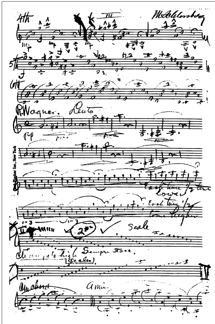
MS 29 R. Wagner exercise showing the octaves leaps go in a different direction in exercise #16 in the Daily Drills .

This examination has shown that, in addition to the changes in note values, there are many other differences between exercises in the Schlossberg manuscripts and the corresponding exercises published in the Daily Drills . The general melodic patterns of the phrases are sometimes completely different. The ascending or descending direction of a line is often changed. Occasionally Schlossberg will have an exercise in the major tonality and then in the minor tonality but the minor tonality might have been left out of the Daily Drills . Extended ranges in the exercises are sometimes different in the two sources in question. The extreme high and low ranges of an exercise in the Schlossberg manuscript is often reduced in the Daily Drills . There are exercises in the