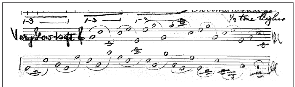
MS 27 Exercise written in whole notes but published in quarter note values in the Daily Drills .

The detailed analysis of manuscripts can be a tedious process but certainly one that can reveal much about our musical tradition and occasionally expose something of a very human nature. Mozart's horn manuscripts with his use of colored ink and snide comments about his friend and colleague Leutgeb is a famous case. The Schlossberg manuscripts also reveal an aspect of the great trumpeter that runs counter to the image expressed in the somewhat stern expression in his photo in the Daily Drills , a sense of humor. Written at the top of six individual pages are the words, "Four in One Not Oil." The first four lines of these pages are scale exercises followed by ascending and descending passages in thirds, roughly corresponding to exercises 102A and 103. At first, this phrase was baffling but, on recollection, Frank Hosticka recalled conversations with William Vacchiano where Vacchiano instructed his student to play those passages in one breath, as his teacher, Max