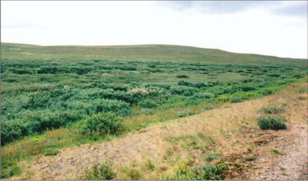
Fig. 5. Type locality of Elachista tanaella sp. n., North Norway, Tana: Faccabæljåkka.

present in ductus bursae near insertion point of ductus seminalis; corpus bursae longer than wide; signum an elongate dentate plate, widest in middle. There is great variation in the length of the apophyses anteriores. In three dissected females the ratios of the length of the apophyses posteriores and the length of the apophyses anteriores are 0.9, 1.6 and 1.9. The ratio for each specimen is the mean value of the ratio of the left and the ratio of the right pair of apophyses. Figs. 3a and 4a show the extremes.