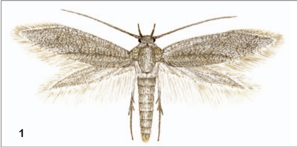
Fig. 1. Elachista tanaella sp. n., adult male (wingspan 11 mm).