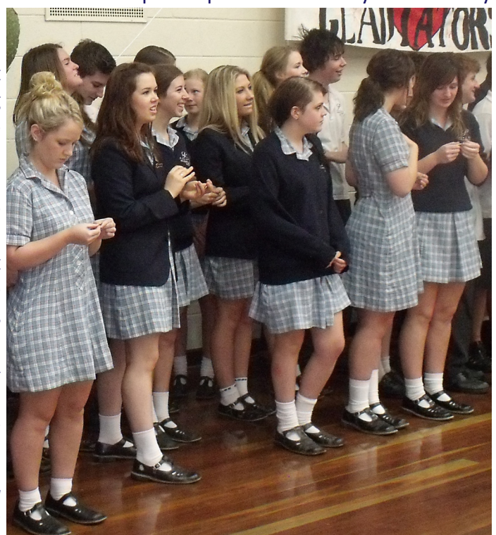
Student Leaders receiving their badges at a whole school assembly earlier this term