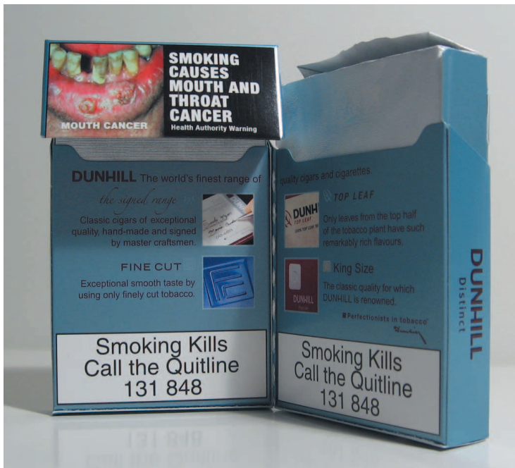
Figure 3 Split package of Dunhill cigarettes

Australia is a quintessential “dark market” where all tobacco advertising is banned. [56] Subtle changes to cigarette packs and trademarks were observed on both Benson & Hedges and Winfield cigarette packs during 2000-2002. [57] When researchers called the company to inquire about the changes, an employee said they were “playing with the logo because we can’t do any advertising anymore.” [57]