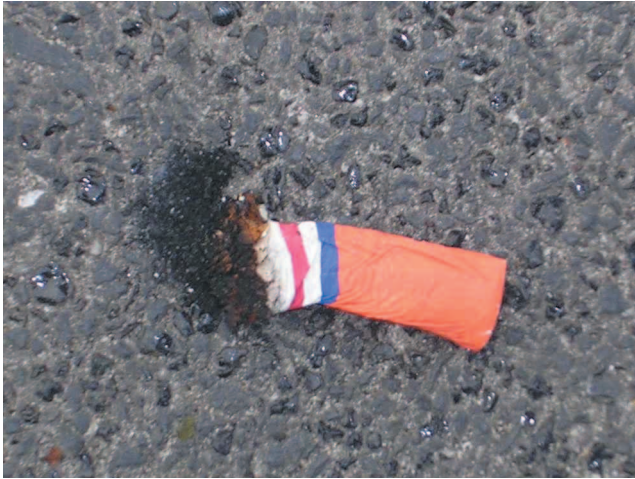
Figure 2 A cigarette printed with the colours of the Dutch soccer team