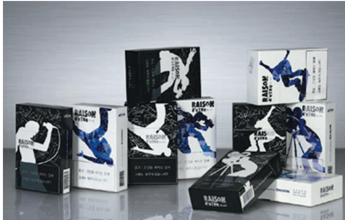
Figure 5 KT&G packaging for the Raison D'etre brand