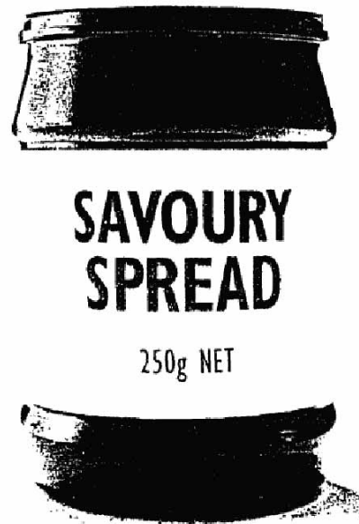
Figure 8 Tobacco industry slippery slope arguments against plain packaging