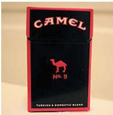
Figure 6 R.J. Reynolds Camel No 9 cigarette aimed at women