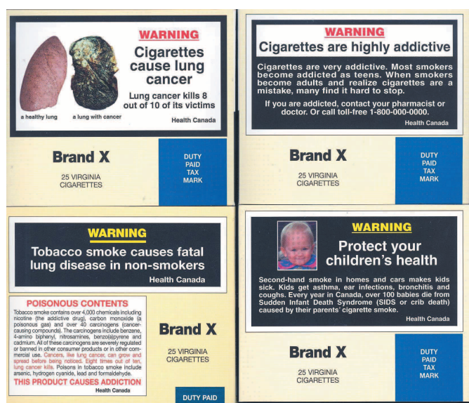
Figure 1 An example of cigarettes in proposed plain packaging