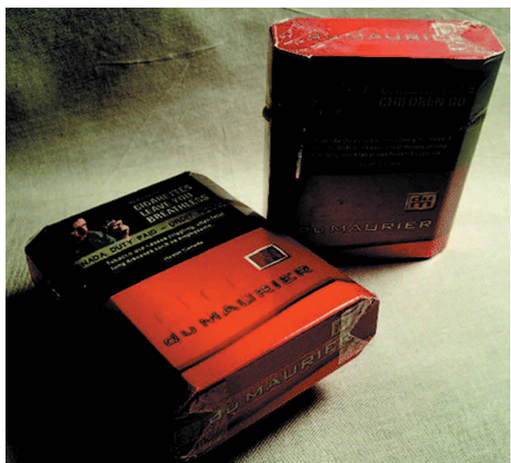
Figure 4 Octagonal packs for the du Maurier brand