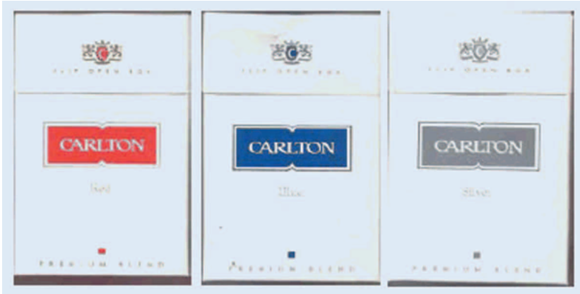
Figure 7 Brazil: cigarette manufacturers substituted red for full strength cigarettes, blue for mild, and silver for light