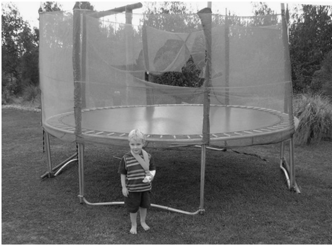
Figure 1 A typical consumer trampoline and enclosure after less than 3 years of use. The pads have deteriorated and been removed, the enclosure net is torn. The subject bounced through the hole in the net and fell to the ground, fracturing his wrist.

specific injury causes, tracking them over time to ascertain whether unwanted injury causes are in decline. For example, if enclosures were becoming widespread and stopping children falling off, then over the period 2002 to 2007 a decline would be expected in the proportion of falling-off injuries.