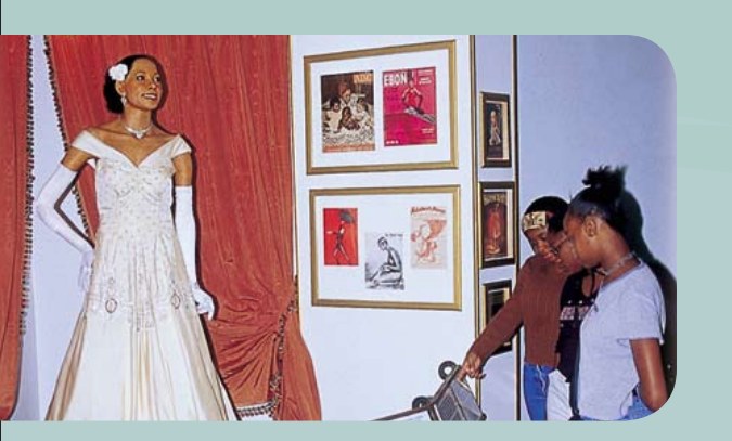
The Griot Museum of Black History and Culture