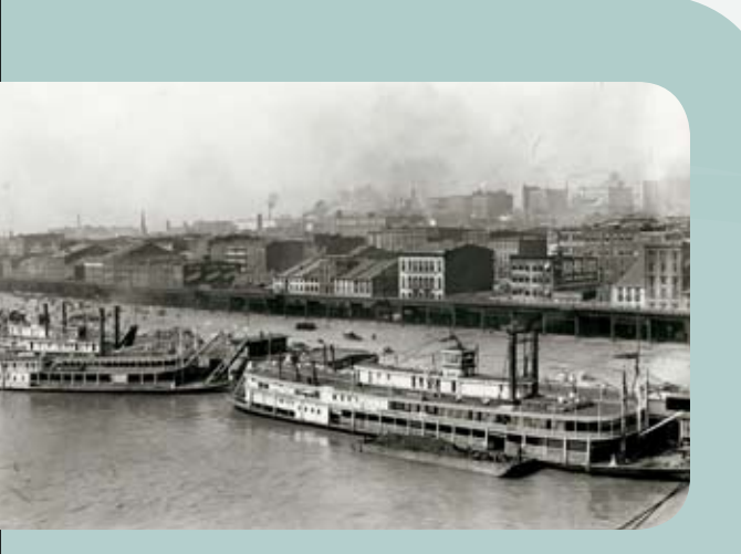
Steamboats on the Mississippi River circa 1904