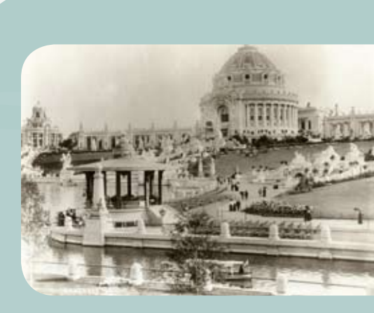
1904 Worlds Fair in Forest Park

The first International Balloon Race was held in St. Louis in 1908, and less than 20 years later, aviation was still in the forefront when Charles Lindbergh captured the world's imagination by crossing the Atlantic non-stop. His 1927 solo flight from New York to Paris took place in an airplane nicknamed "Spirit of St. Louis," thanks to financial backing by local businessmen.