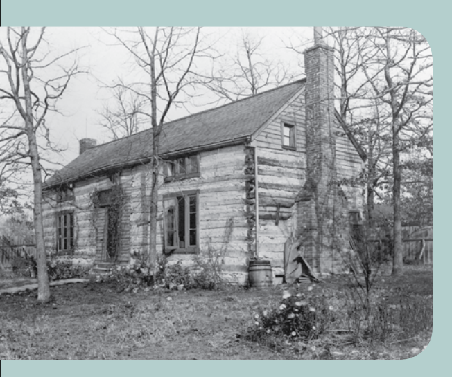
White Haven, the Ulysses S. Grant National Historic Site circa 1920