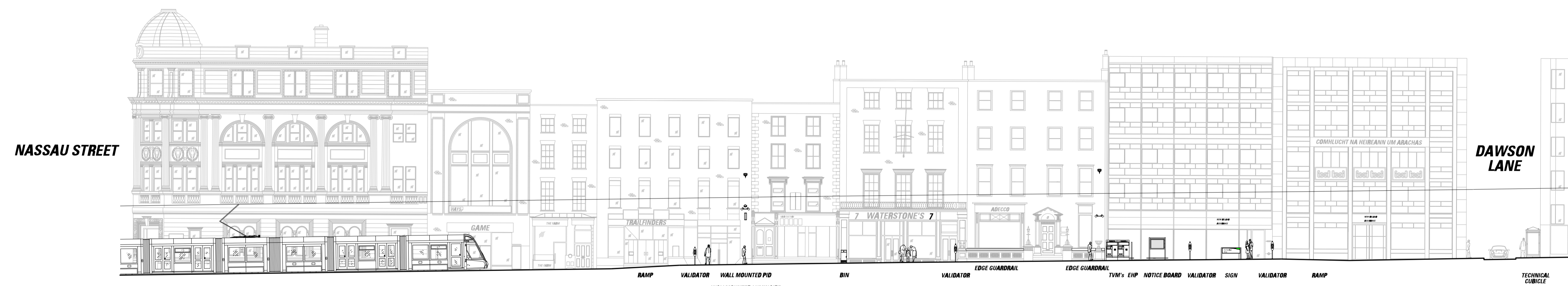
ELEVATION A-A SCALE 1:200