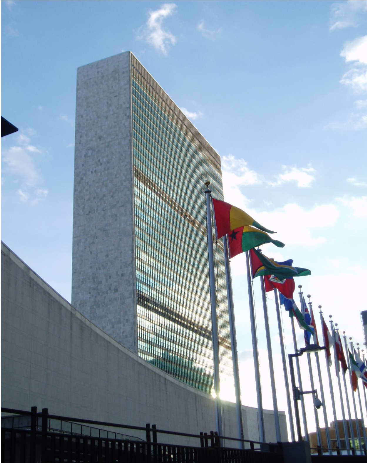
United Nations, New York