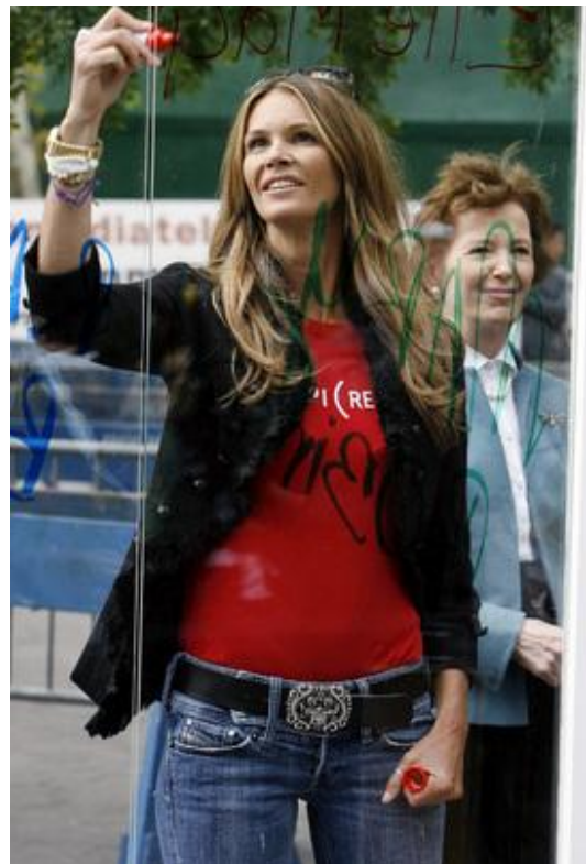
Australian Model Elle Macpherson, and Mary Robinson previous Prime Minister of Ireland and an Elder, participate in the OXFAM "In MY Name: End Poverty Campaign".