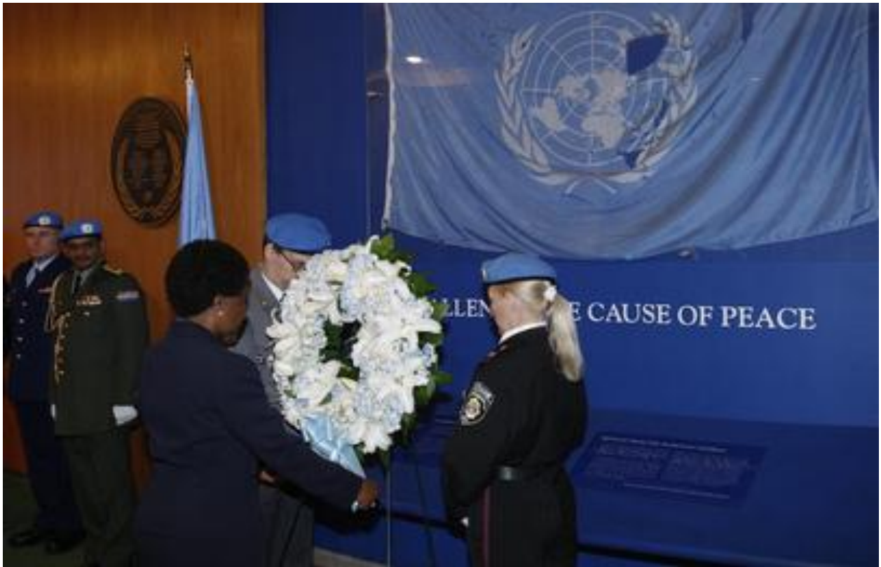
International Day of United Nations Peacekeepers (29 May): Deputy Secretary-General Asha-Rose Migiro (centre left) and UN Peace Keepers observe the wreath-laying ceremony.