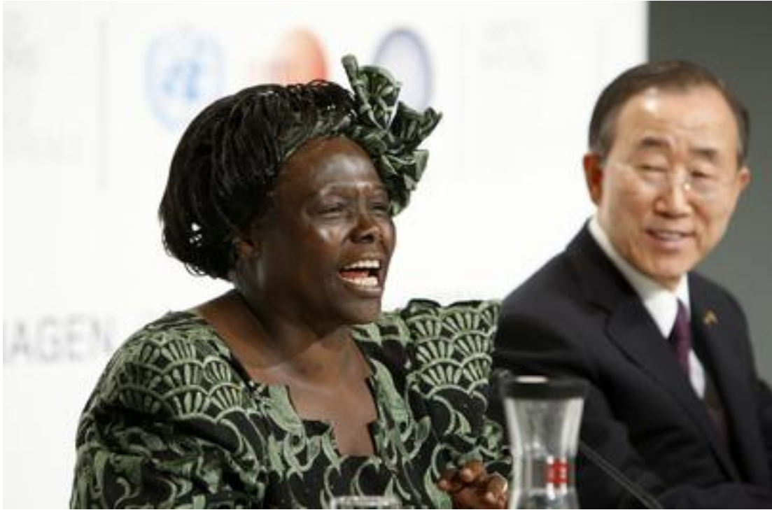
Secretary-General Ban Ki-moon inducts Kenyan Nobel Peace Prize laureate and green advocate Wangari Maathai as a UN Messenger of Peace who founded the Green Belt Movement, which has planted more than 40 million trees on community lands across Africa.