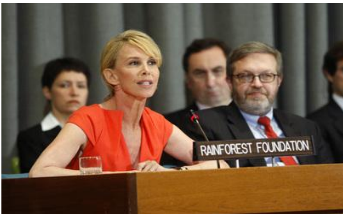
Trudie Styler, Co-founder of the Rainforest Foundation, addressed the UN General Assembly's informal meeting on climate change and the status of intergovernmental negotiations. Ms. Styler discussed the foundation's work in protecting tropical rainforests and their indigenous populations. The Rainforest Foundation was founded in 1989 by Sting and his wife Trudie Styler.