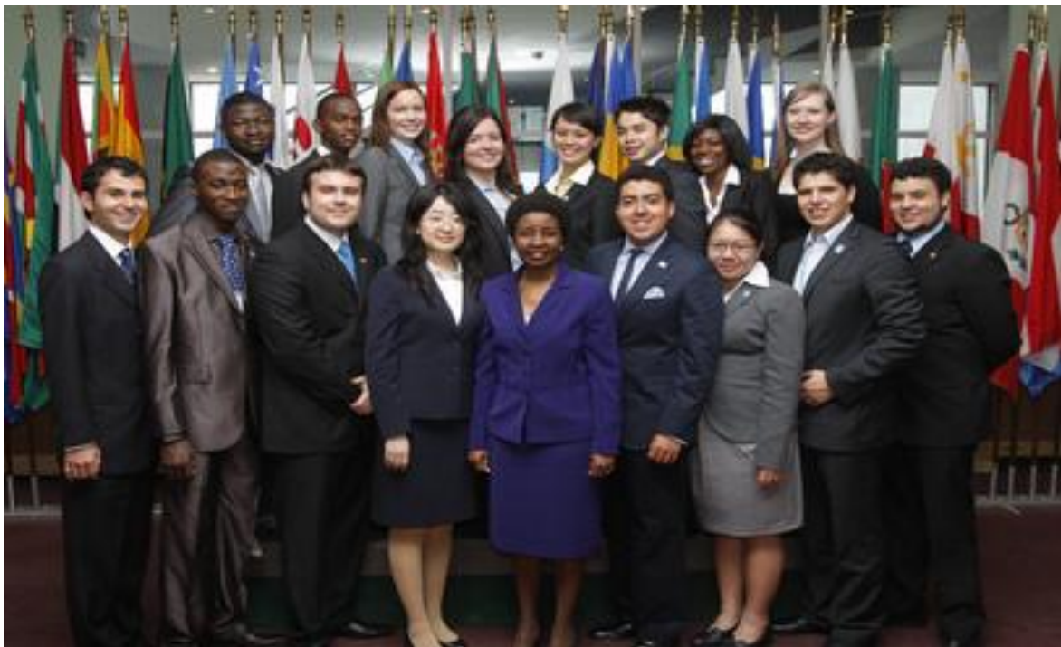
Deputy Secretary-General Asha-Rose Migiro (front, centre) with participants of the second annual Global Model United Nations Conference, Kuala Lumpur on 14-18 August, 2010