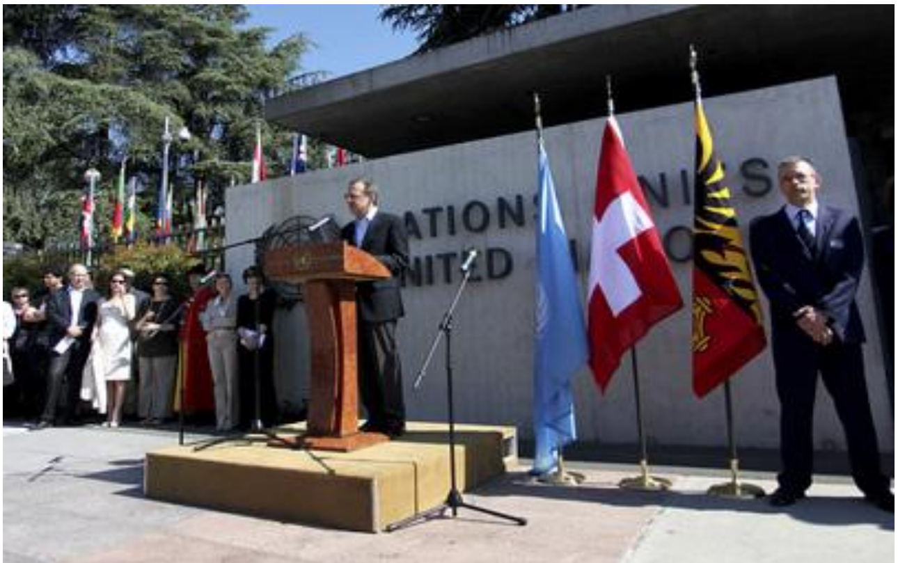
World Environment Day (5 June) Sergei Ordzhonikidze, Director-General of the United Nations Office at Geneva (UNOG), speaks at a celebration of at the Palais des Nations in Geneva, Switzerland.