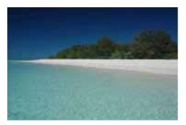
Figure 4 Mnemba Island: view of the island from the coastal fishing village of Muyuni/Kijini, the island's lodge accommodation and sandy beaches

A fee of US $ 1 per person per day started being charged to tourists visiting MIMCA in March/April 2003. This fee has subsequently been increased to US $ 3 and may be further increased to US $ 10 according to information provided by government officials in a recent meeting<sup>35</sup>. Around 20 tourism operators engage in diving and snorkelling activities in the atoll, both from the formal and informal sectors, mainly from Nungwi, Kiwengwa and Matemwe. In days during the high season between June and March there may be up to 300 people visiting the reef<sup>36</sup>, the preferred areas being the House Reef and Kichwani (Map 1). Some of these tourists are guests at the Mnemba Island Lodge, a luxury lodge with 20 beds that enjoys an occupancy rate around 95% <sup>37</sup>.