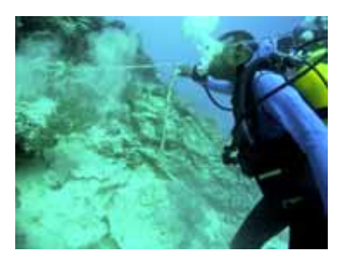
Figure 5 Damaged areas and signs of unsustainable use of the Mnemba Atoll

Considering the number of people that depend on the Mnemba Atoll for a living, it is hardly surprising that the area is becoming degraded. If there is one overall message that this study wishes to convey, is that the Mnemba Atoll is on a non-sustainable path unless steps are taken that will lead to effective protection and sustainable resource use.