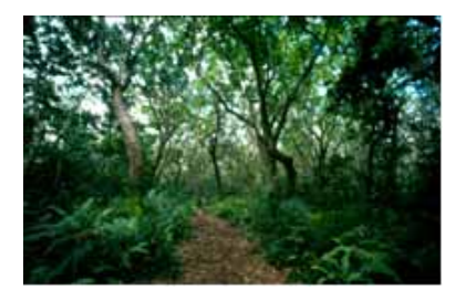
Figure 6 Chwaka Bay mangroves, seagrass beds (under water) and Jozani Forest

To the south of Chwaka Bay, Jozani Forest is the largest area of near natural vegetation on Unguja Island representing the vegetation types that were once common throughout the area<sup>53</sup>. It is a small, almost entirely regenerated groundwater-forest, which includes a 12 ha plantation where virtually all forest species known for Unguja occur. Birds include three endemic races (Tauraco fischeri zanzibaricus, Andropadus virens zanzibaricus and Nectarinia veroxii zanzibarica), plus a fourth species (Nectarina olivacea granti) that is shared with Pemba Island and a fifth (Cercotrichas quadrivrigata greenwayi) that is shared with Mafia Island<sup>54</sup>. Jozani is also part of a larger biodiversity hotspot, the Eastern Arc Mountains and Coastal Forests, which runs along the coasts of Tanzania and Kenya and includes Zanzibar.