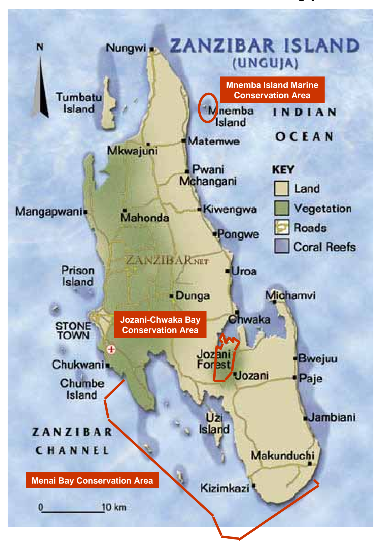
MAP 2: Current Marine Protected Area Network in Unguja Island