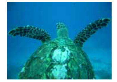
Figure 3 Marine life in the Mnemba Atoll