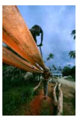
Figure 7 Uses of natural resources in Jozani-Chwaka Bay: seaweed farming, octopus harvesting, tourism and wood exploitation

At Jozani considerable efforts have been made to work with surrounding communities. Each village has an operational conservation committee, and the Jozani Environmental Conservation Association (JECA) is an NGO representing villagers from key communities around Jozani. It carries out a number of activities including conservation education and forest protection<sup>69</sup>. The investigators were able to observe interactions between rangers and community members personally and there clearly exists mutual respect and collaboration.