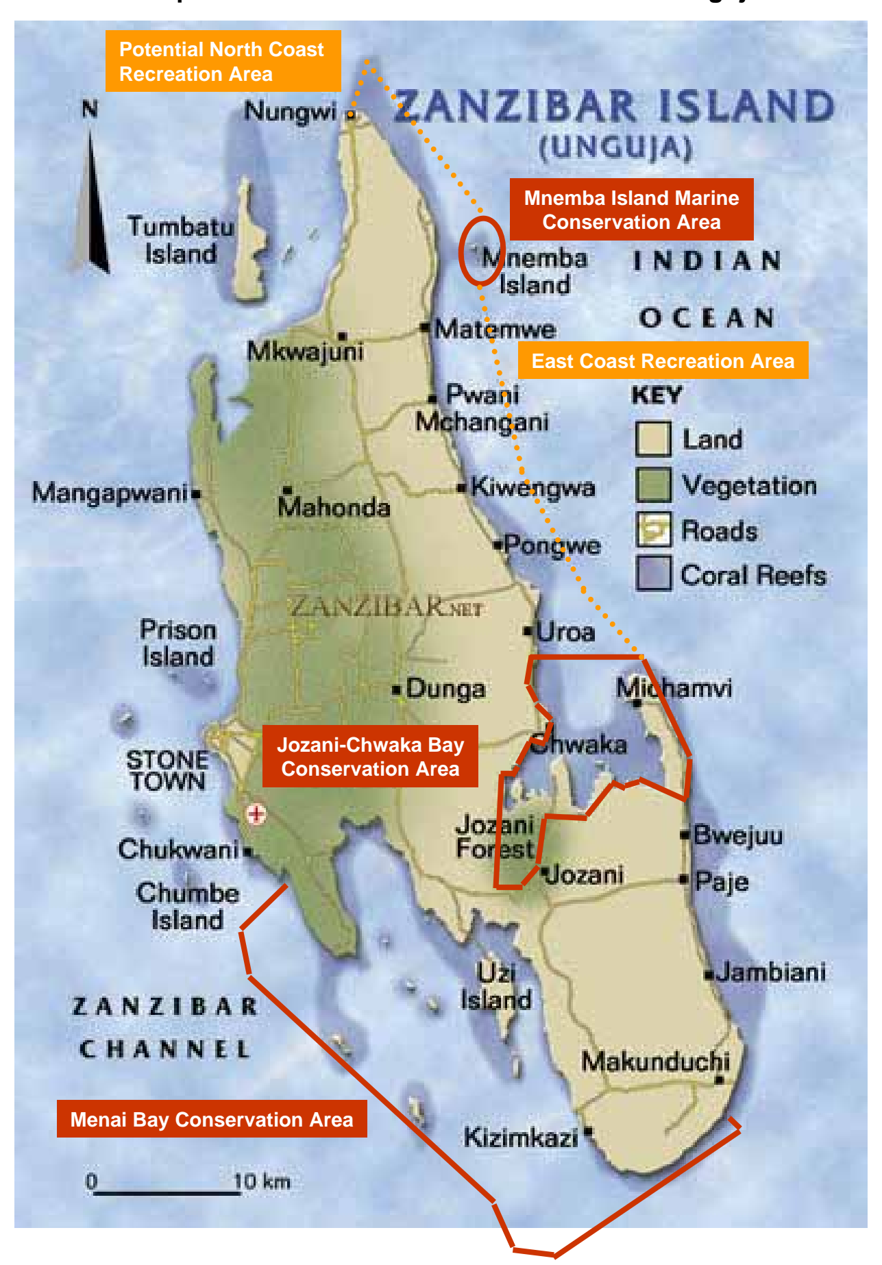
MAP 3: Proposed Marine Protected Area Network in Unguja Island