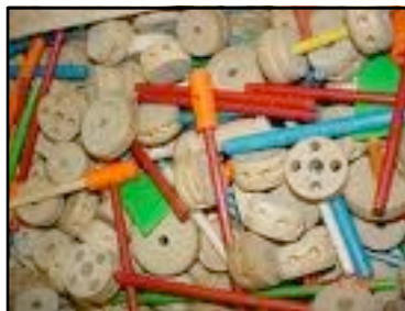
Toys, p. 2