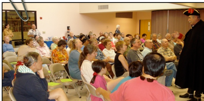
Amazing Arizona presentation at the Ethel Berger Center, p. 8