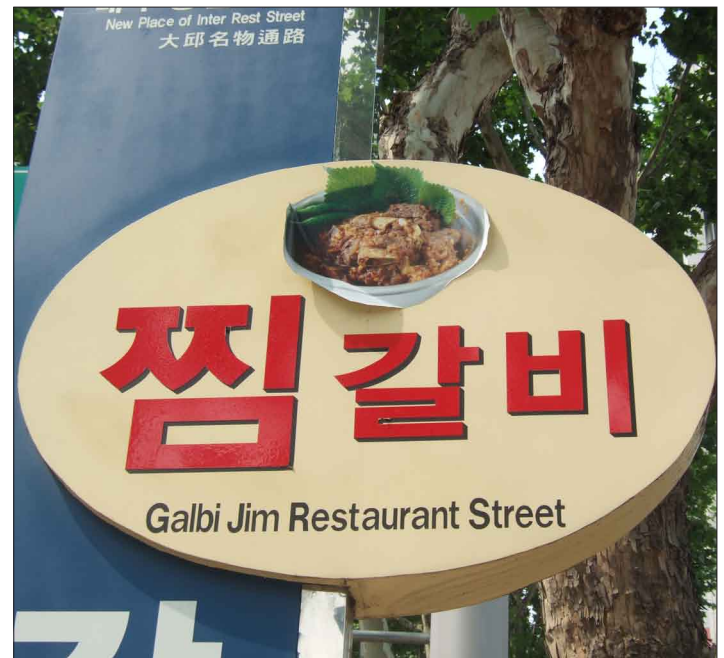
The Galbi Jim Restaurant Street sign stands visibly on the road for suitors to find.

The Dongin-dong steamed pork street was not created intentionally. In order to make ends meet, people opened up their own stores because it is a lucrative business. As a result, the space is limited and compacted with a mass of steamed pork restaurants. There are currently 15 restaurants located on the Dongin-dong Galbi Street.