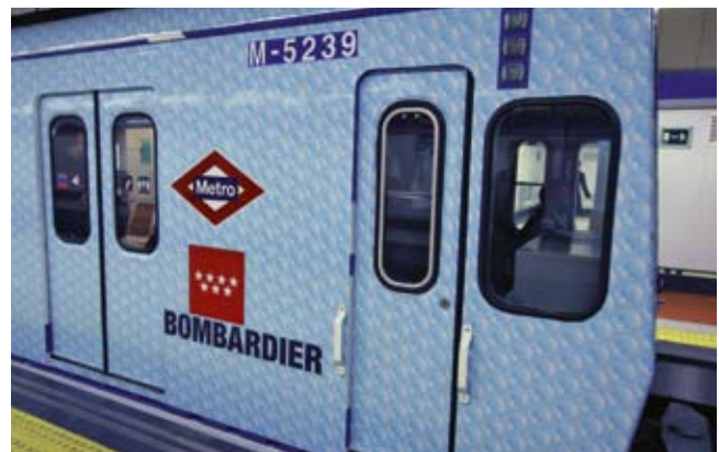
Advertising campaign promoting increased frequency of trains with CBTC