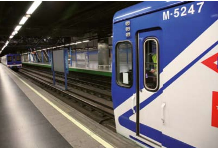
Shorter headways with CITYFLO 650

CITYFLO 650 is a CBTC, moving block ATC (Automatic Train Control) system. It fully exploits the capacity of the system and reduces energy and wear on the track and vehicles. The system does not require track circuits and can be used as an overlay radio-based train control system to upgrade existing fixed block systems.