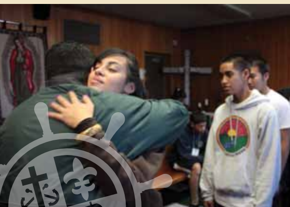
There is a retreat offered at every class level—an opportunity for personal and spiritual growth.