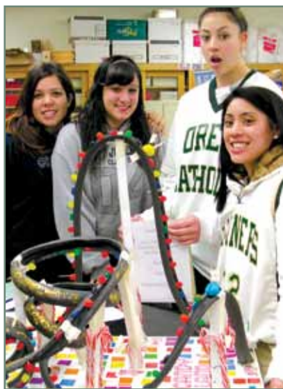
In physics classes, the students' first semester culminating project is to design, analyze and construct a model roller coaster.