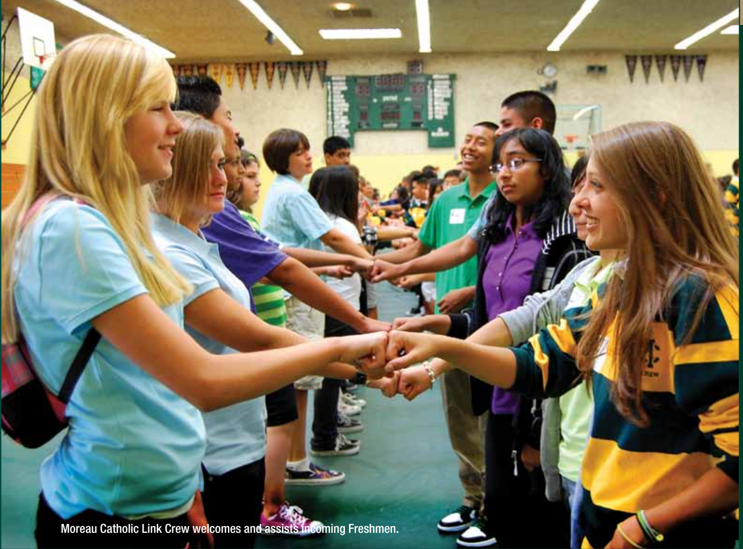
Moreau Catholic Link Crew welcomes and assists incoming Freshmen.