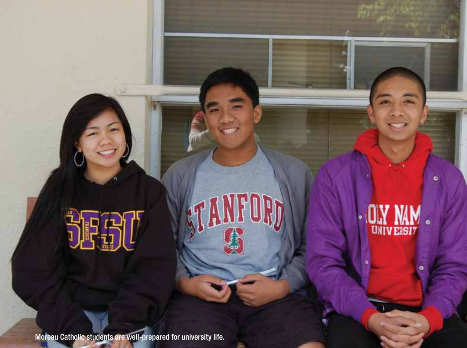
Moreau Catholic students are well-prepared for university life.