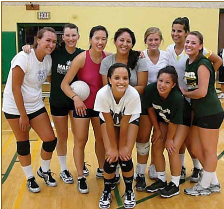
Moreau Catholic's alumni get together for athletic events that renew old friendships and provide opportunities for networking. Mariner Girls Volleyball alumnae look forward to their yearly reunion games when they play against Varsity and against other.