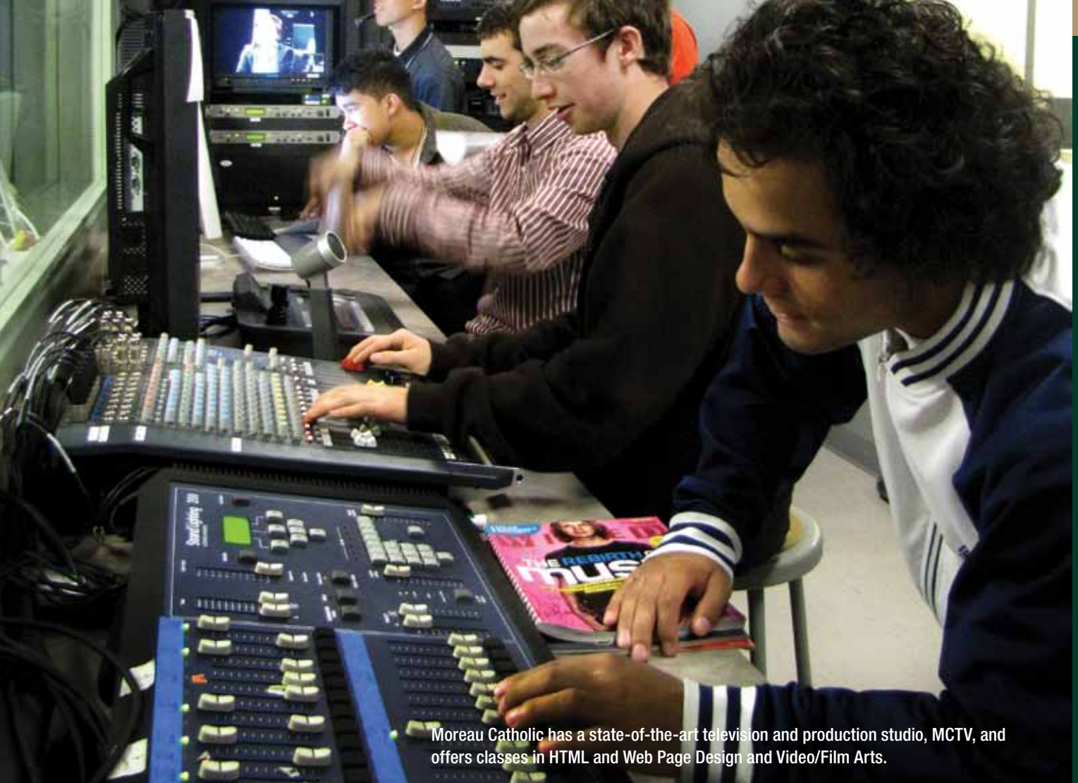
Moreau Catholic has a state-of-the-art television and production studio, MCTV, and offers classes in HTML and Web Page Design and Video/Film Arts.