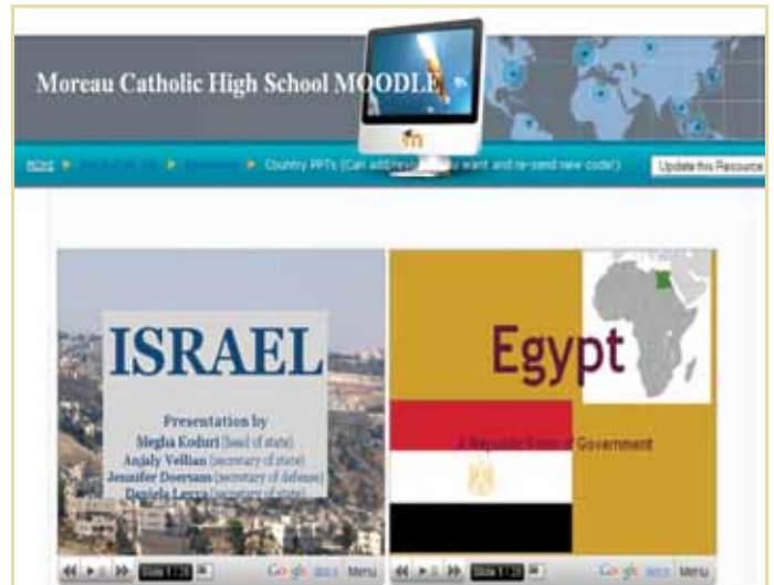
STUDENTS IN PEACE AND CONFLICT STUDIES participate in a Middle East Peace Summit, where they role play peace negotiations and experience the challenges of peace talks.