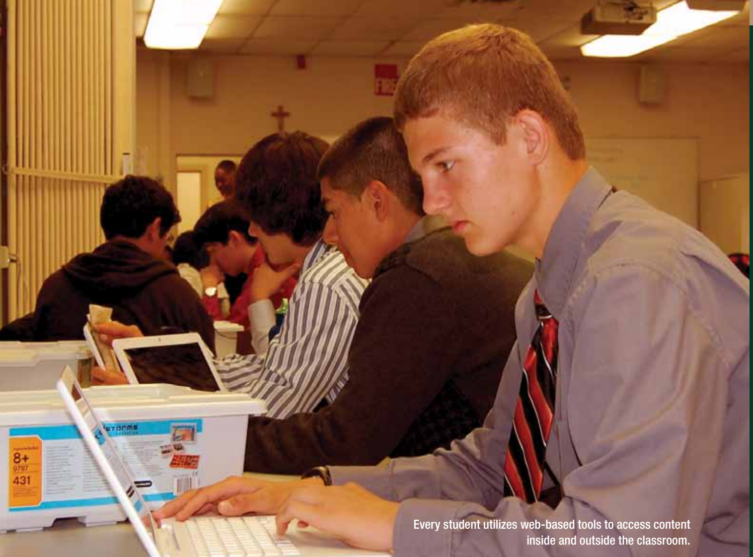
Every student utilizes web-based tools to access content inside and outside the classroom.