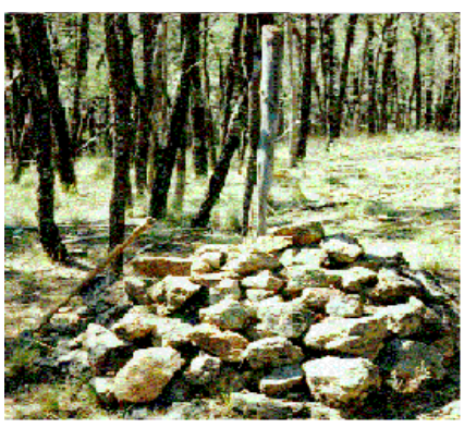
Border cairn No. 5 (arris cairn east of Snowy River) Border cairn No. 4/4 (600m west of Snowy River)