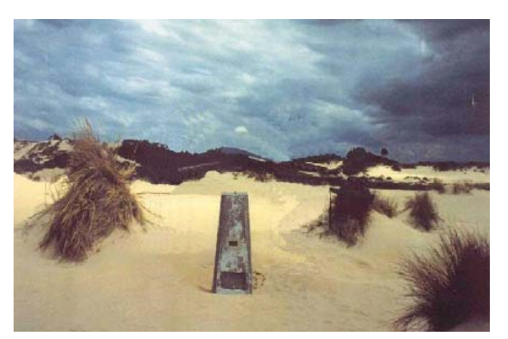
Pillar at Wauka (Conference Point), Cape Howe<sup>111</sup>

From 1870 to 1980 the Black-Allan border attracted much controversy, especially the section of coast near Conference Point. The original cairn marking Cape Howe was supposedly damaged, blown up, by fisherman wishing to avoid license fees. 105 In 1897. Surveyor Francis J. Gregson attempted to re-establish the mark, but had his equipment destroyed. And later, in 1919 E.H. Lees rebuilt the stone cairn at Wauka, with a galvanized pipe centered over the bottom of a glass bottle placed at the time of the original survey. 106 In 1967 the Victorian Department of Lands and Surveys rediscovered this cairn, officially named it 'Wauka' and established it to be 180 metres West North West of Conference Point. 107 At this time the old cairn bottle placed by Allan at Mount Carlyle was replaced with a bronze geodetic survey plaque, two new trees were marked as the originals had rotted, and a new triangulation station was built at Mount Buckle. 108 In 1978 requests from the Fishery Department for better visual determination of the border from sea, led Surveyor David Vincent to erect a pillar named 'Allan' on the coast. 109 At this time the NSW Lands Department also placed a pillar at Wauka and put concrete pillars as markers at Mounts Carlyle and Buckle, where the cairns were in disrepair. 110