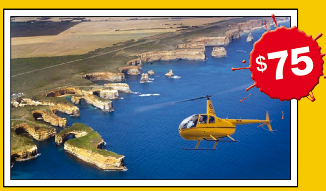
Helicopter flight prices valid until 31st March 2012

So long as you're visiting the Port Campbell National Park, why not take to the skies and get a whole new perspective on this amazing coastline. Great Ocean Road Helicopters will enthral you with a stunning flight of about 7 minutes duration. Book your flight with your tour and pay just $200!