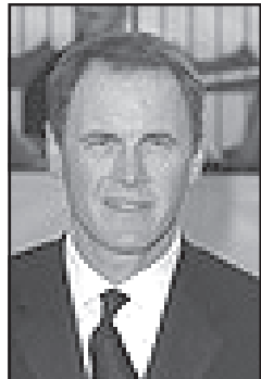
Mark Moses, '76

Mark Moses is better known to America as Paul Young on the TV hit series, "Desperate Housewives." He has had a distinguished career in