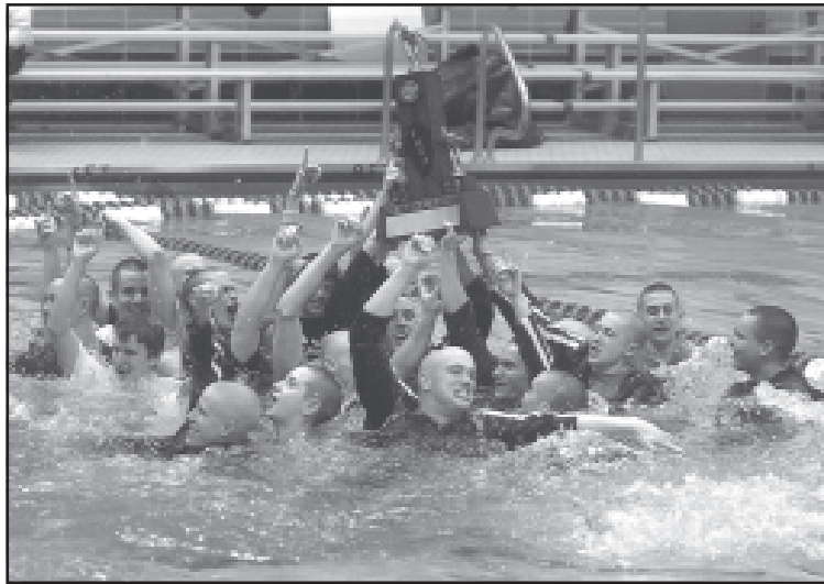
ETHS Boys' Swim Team took the traditional plunge after winning the state championship. The state meet was held at New Trier High School.