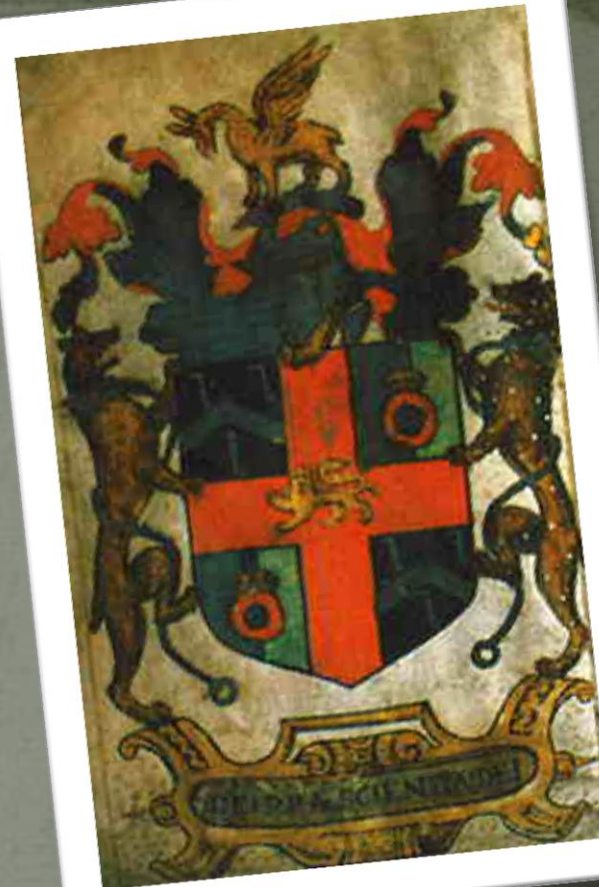
Arms of the Company of Barber-Surgeons *