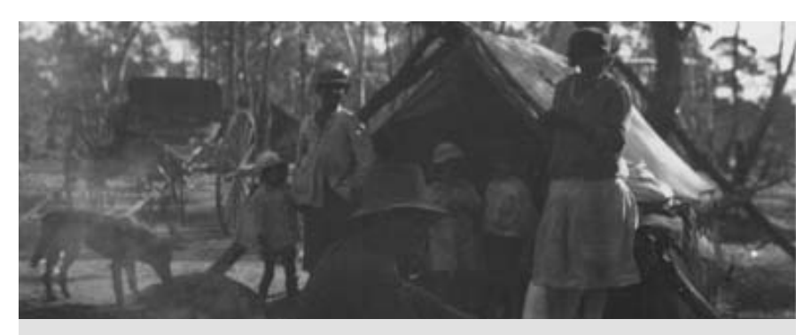
Aboriginal Camp - Tingha, circa 1925

There are detailed records (one or two pages each) of 800 wards sent into employment between 1916 and 1928. There is a further list of 1500 names, without details, of children sent in 1936. There are no systematic records of Aboriginal children sent into State or religious homes not specifically designed for Aborigines. The number of children of Aboriginal descent whom the Board did not recognise as Aboriginal is also unknown, but likely to be substantial after the 1950s. After that time, Welfare Officers were instructed to hand over Aboriginal children of 'lighter caste' to the Child Welfare Department if they were to be committed. In addition there was an unknown number of children committed unofficially, of whom no records appear now to exist. This includes children of whom the Board asked local church bodies or individuals to take charge. Often three or four families handled the children before a permanent home was found, and the records were lost on the way. Another category of removed children which is difficult to quantify are those who went away to white people for a 'holiday' and did not return.