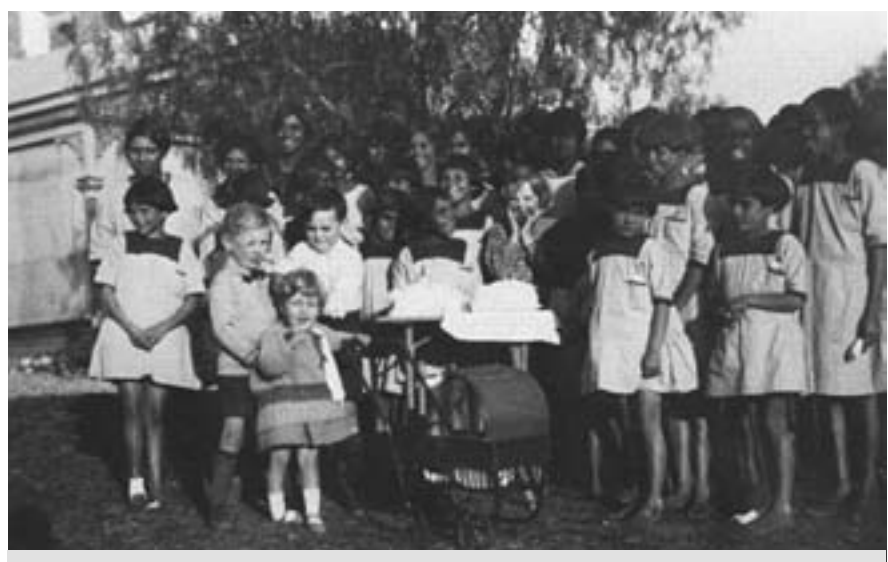
Cootamundra Home, circa 1930

New home, beautifully furnished, all furniture is modern style made by husband. New Australian Dutch family. Lovely children, very well-mannered. This seems ideal for small girl. Better surroundings could not be found. Recommended.