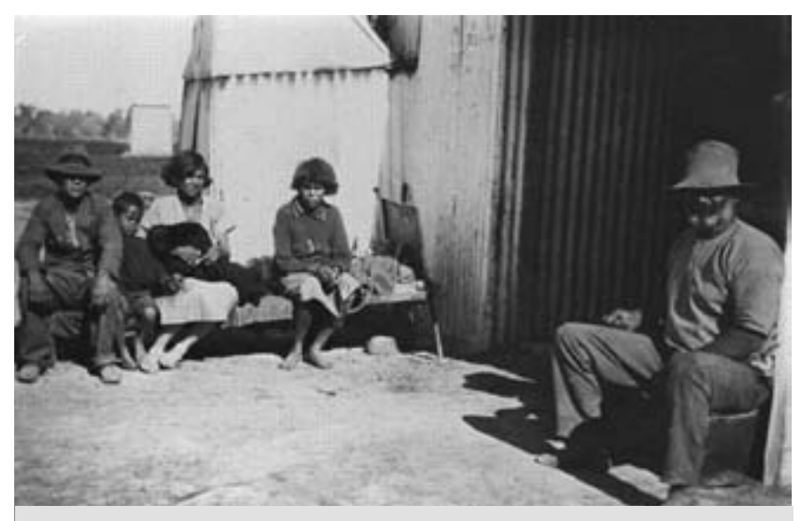
Aboriginal Camp - Brewarrina, 1932

Those who wanted to be were not allowed to be. When it became obvious that Aborigines didn't want them, or want to be like them, the whites resorted to force.