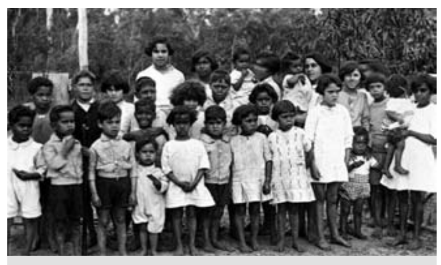
Bomaderry Home, 1928

The brutality of some of the officials was compounded by the lack of external control. Despite the enquiry's findings, the management at Kinchela does not seem to have changed for the better. Eight years later there was another enquiry into what the Board called 'sexual deviance'. An Inspector from the Child Welfare Department thought the boys were bored even though they had too much manual work to do.