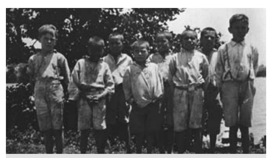
New Boys at Kinchela, 1932

The psychological issues in the institutionalisation of the children are most complex, and I shall not pursue the subject except to make two points. One is that very few indeed of the ex-institution people have been, in fact, accepted by the whites as equals. No amount of 'white' behaviour or attitudes can overcome skin-colour, or restore dignity to one's self-concept. The other is that people who accepted the white culture as superior will not readily admit to the white's crime of trying to 'breed out' the Aboriginal race. Other products of separation can also be recognised. One is the large group of people who will not talk of their experiences at all. Their refusal to talk tells its own story. The alcoholics too tell a story without words, as do the ex-wards who, deprived of parental caring behaviour as children, later abandoned their own children. Every one of the five thousand children removed from their parents had, and