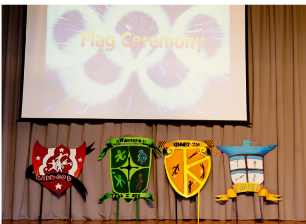
Newly created House Banners from the Year 9 Olympics

Parents of junior students will have received their son's report with this newsletter. I hope that it