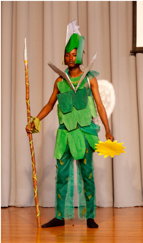
YEAR 10 – WOW