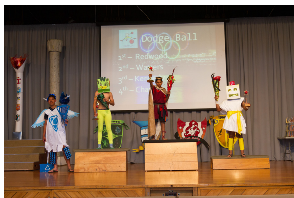
Year 9 Olympics Left: Entrance of the Redwood team Top: Entrance of Watters Second: Entrance of Kennedy Third: Entrance of Chanel Bottom: Mascots on the victory dais