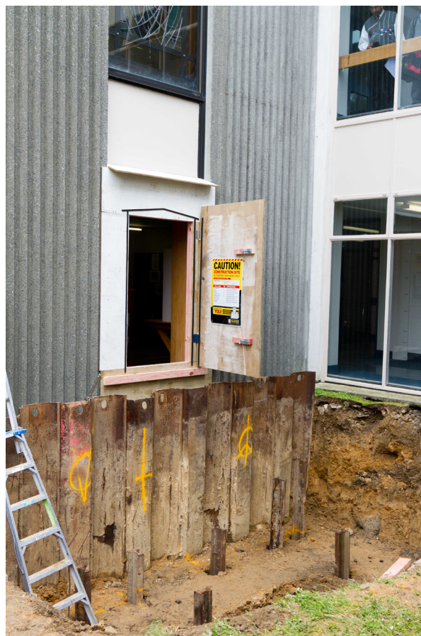
Piles being installed for the foundations of the new lift which will go outside the staffroom.